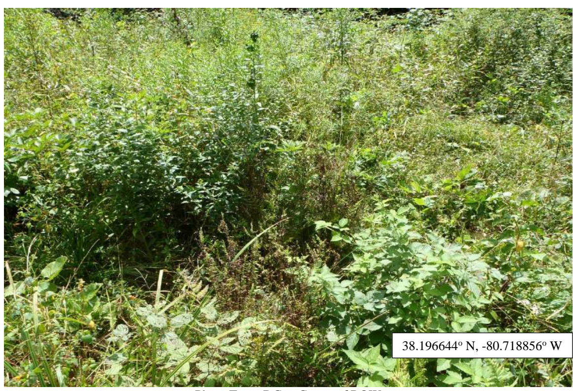
Photo Type: DG at Center of ROW Location, Orientation, Photographer Initials: Center of Right of Way, Down-Gradient View, TF/AG/TA