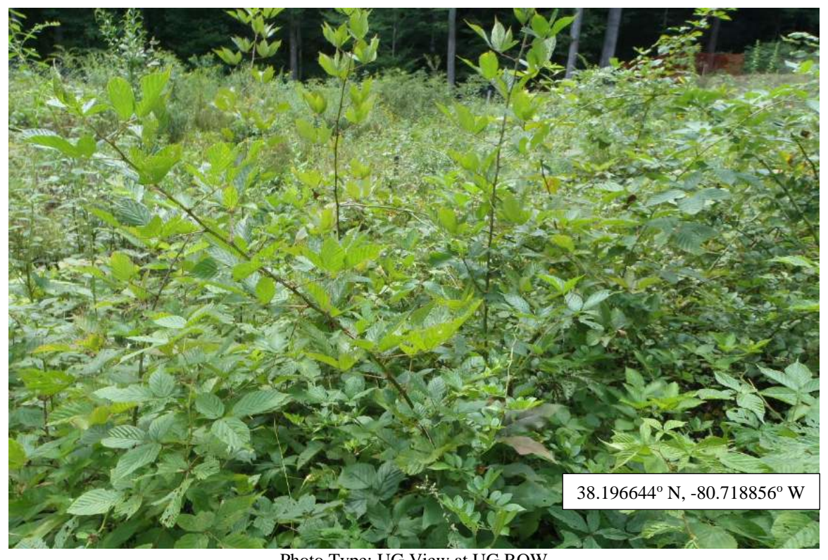
Photo Type: UG View at UG ROW Location, Orientation, Photographer Initials: Up-Gradient Right of Way, Up-Gradient View, TF/AG/TA