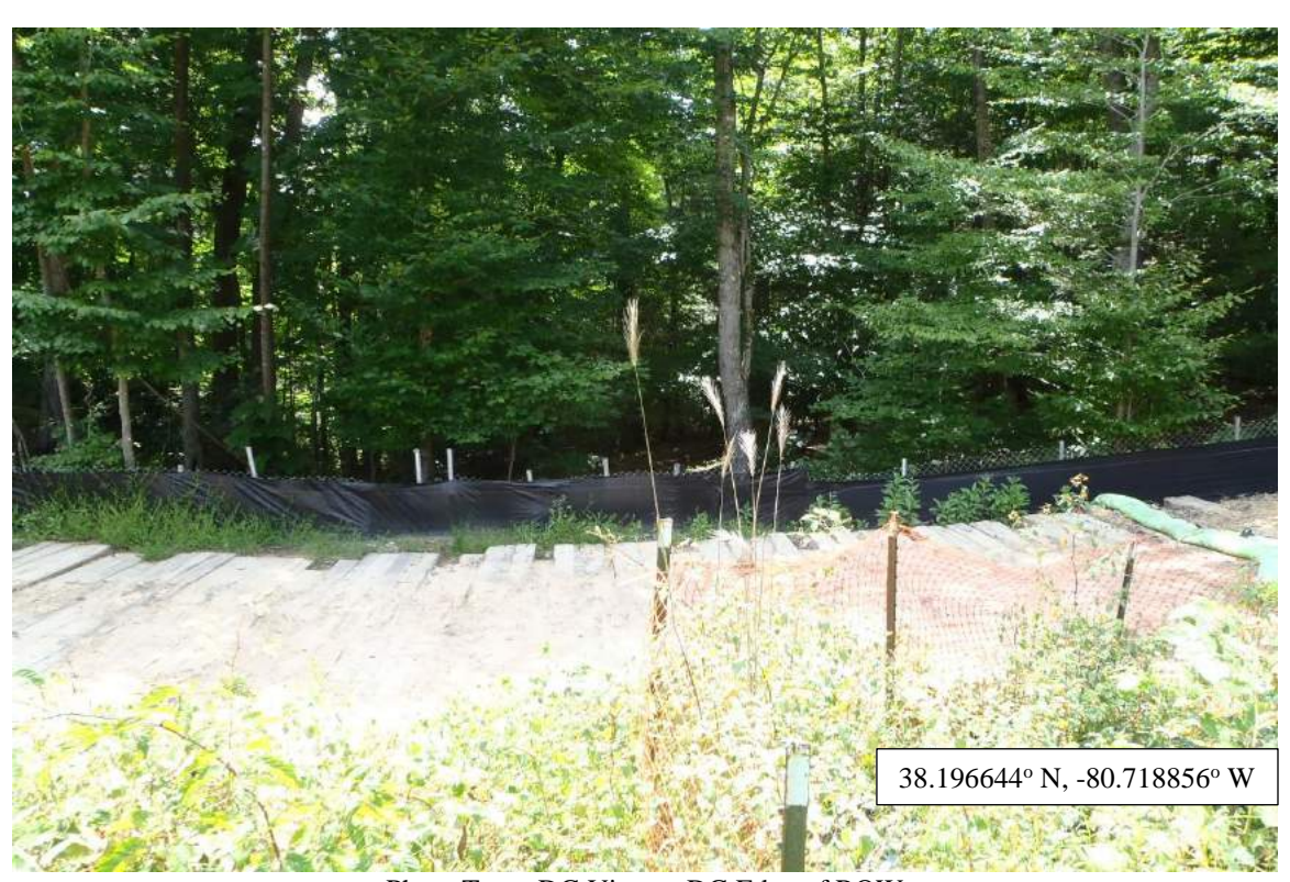
Photo Type: DG View at DG Edge of ROW Location, Orientation, Photographer Initials: Down-Gradient Edge of Right of Way, Down-Gradient View, TF/AG/TA