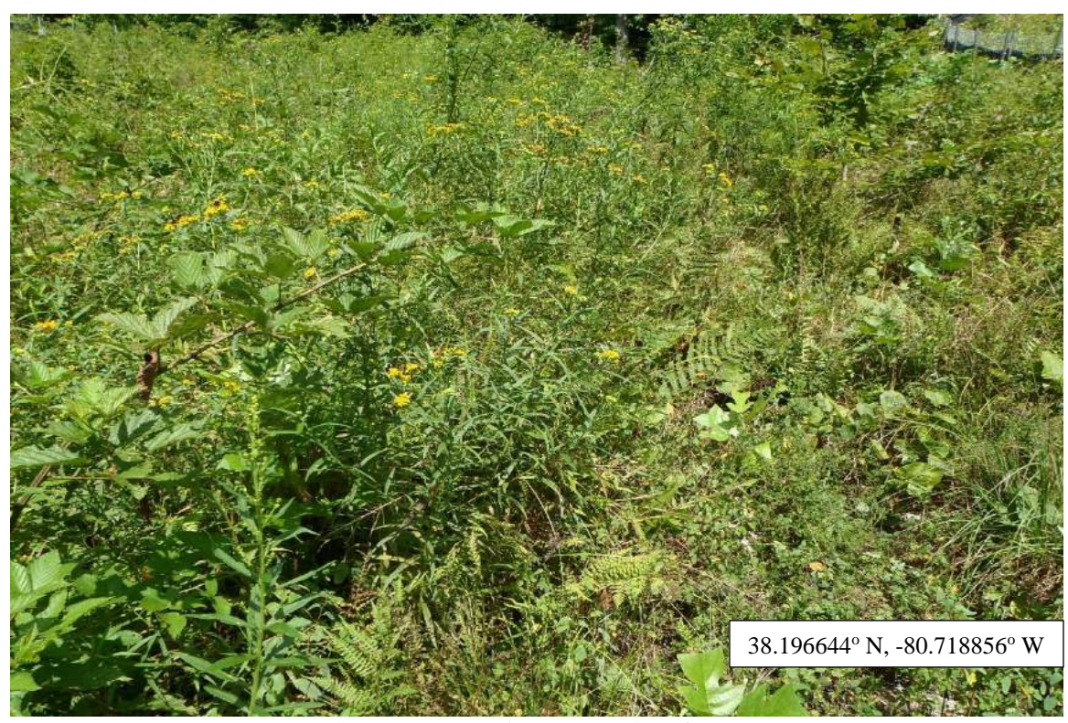
Photo Type: UG View at DG Edge of ROW Location, Orientation, Photographer Initials: Down-Gradient Edge of Right of Way, Up-Gradient View, TF/AG/TA