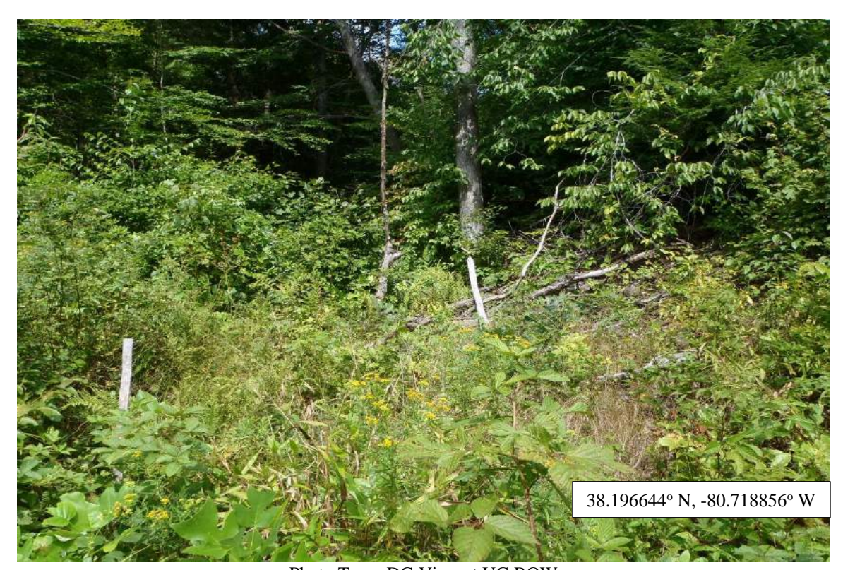
Photo Type: DG View at UG ROW Location, Orientation, Photographer Initials: Up-Gradient of Right of Way, Down-Gradient View, TF/AG/TA