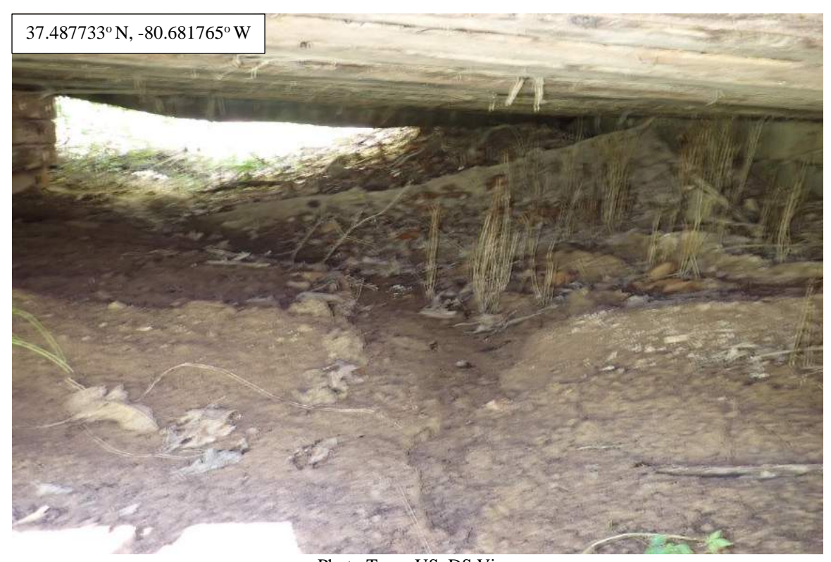
Photo Type: US, DS View Location, Orientation, Photographer Initials: Upstream Edge of Right of Way, Downstream View, AK/WP/RA/EW