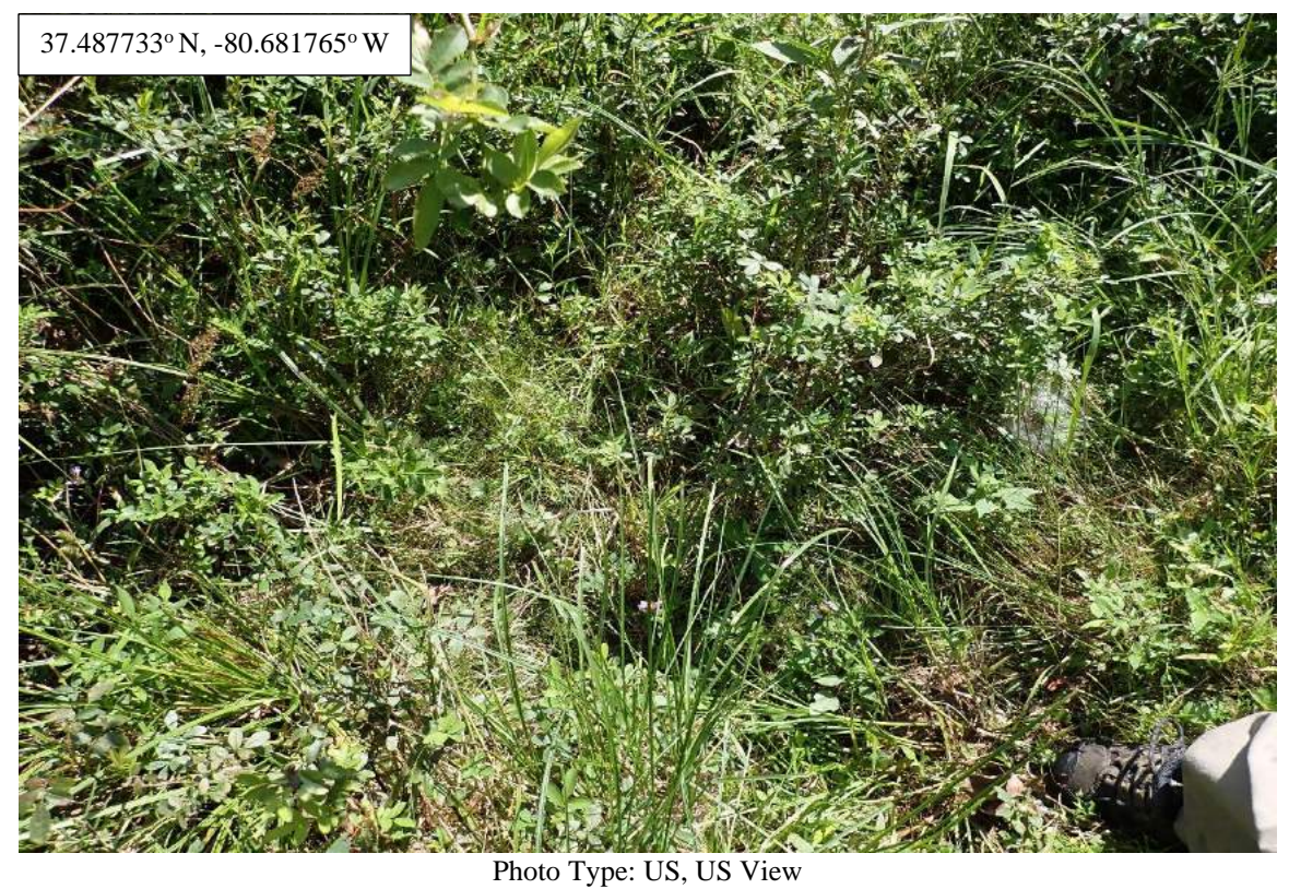
Location, Orientation, Photographer Initials: Upstream Edge of Right of Way, Upstream View, AK/WP/RA/EW