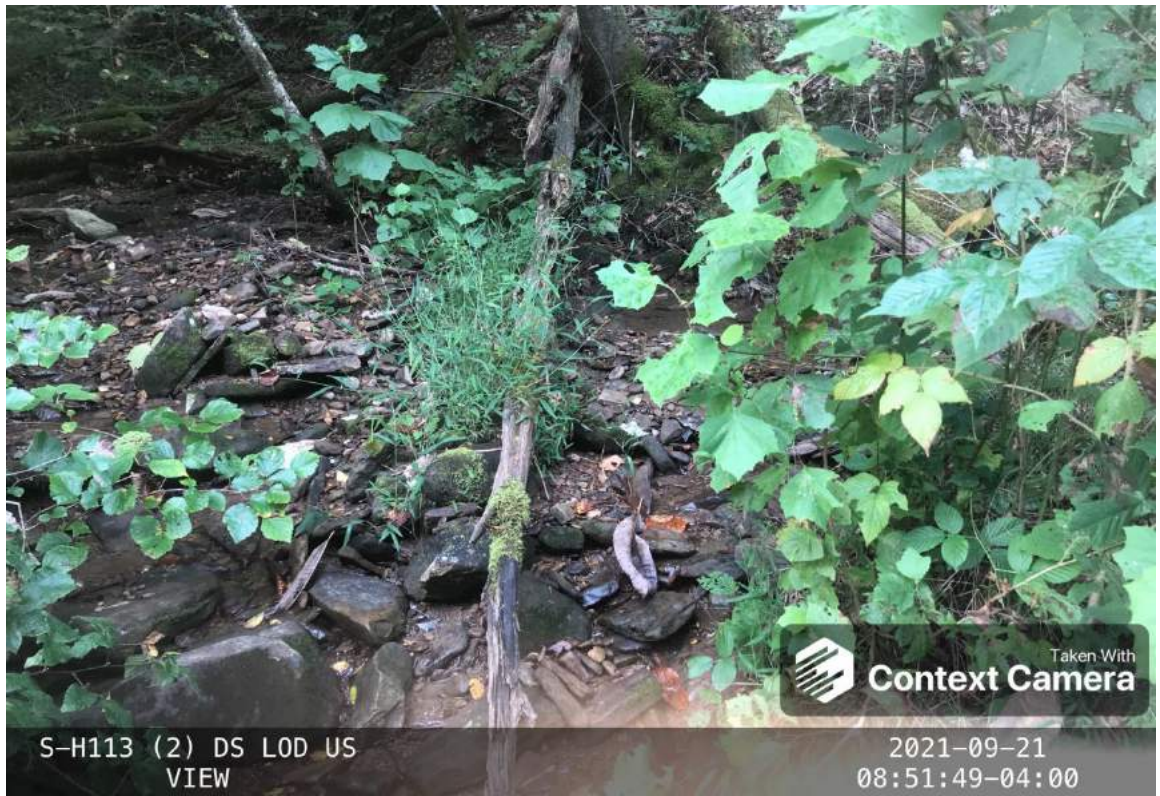
Spread C Stream S-H113 (2) (Pipeline ROW) Webster County

Photo Type: DS, US View Location, Orientation, Photographer Initials: Downstream Edge of ROW, Upstream View, RH, VM Lat: 38.612878 Long: -80.503687