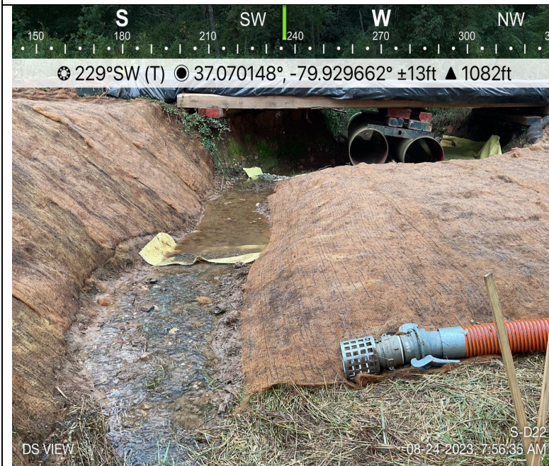
Photo Description: Downstream view of permitted impact area during post-construction assessment.