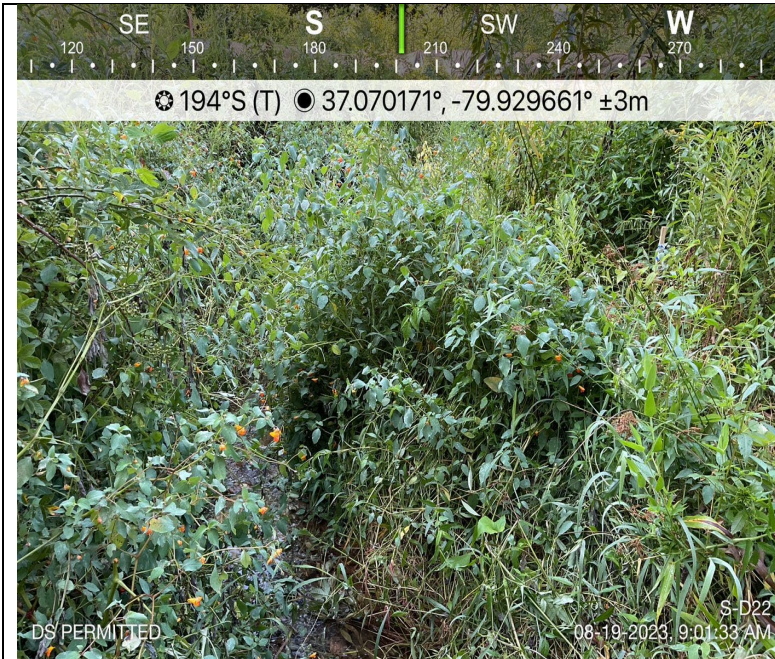
Photo Description: Downstream view of permitted impact area during pre-construction assessment.