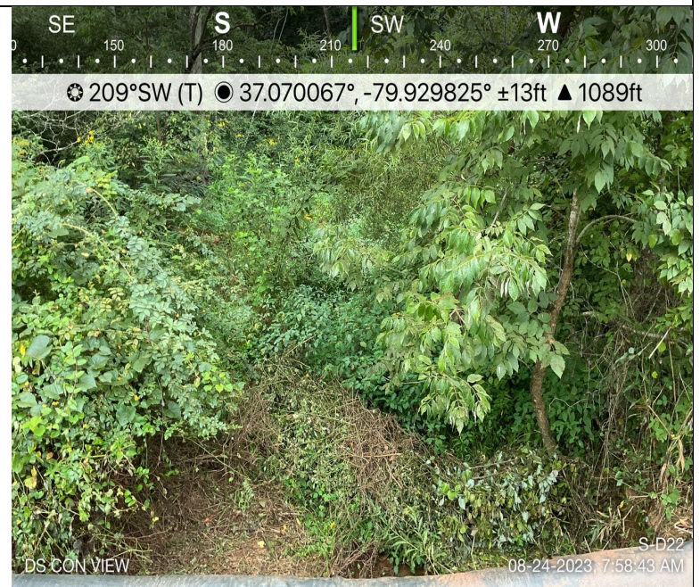
Photo Description: Downstream view of unpermitted area during post-construction assessment.