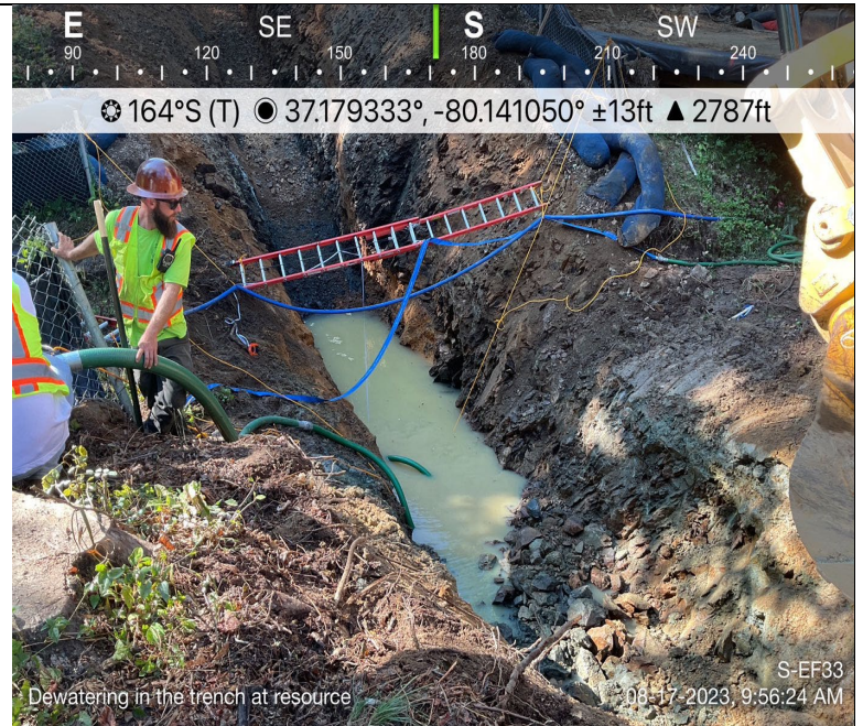
Photo Description: Trenching; dam and pump, and dewatering operation