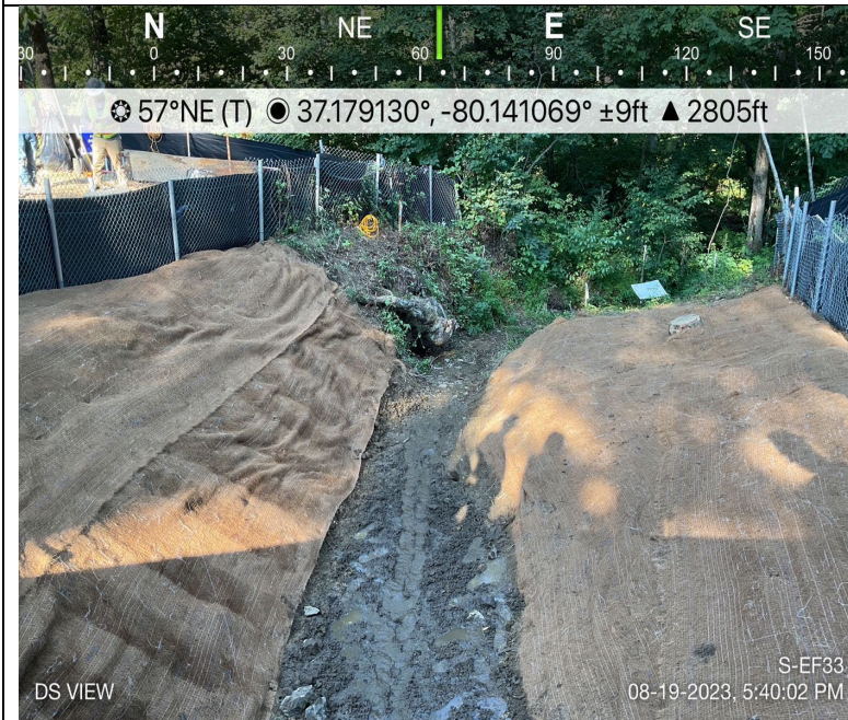
Photo Description: Downstream view of permitted impact area during post-construction assessment.