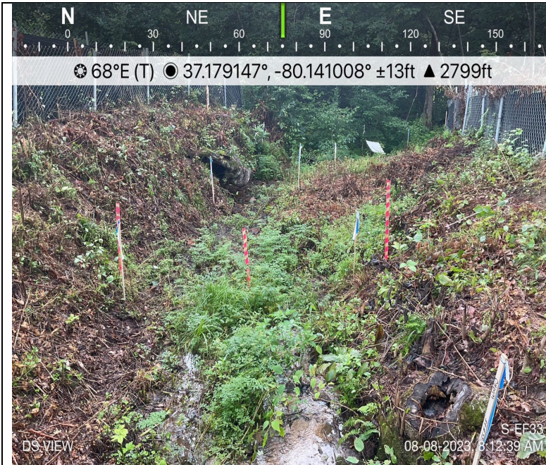
Photo Description: Downstream view of permitted impact area during pre-construction assessment.