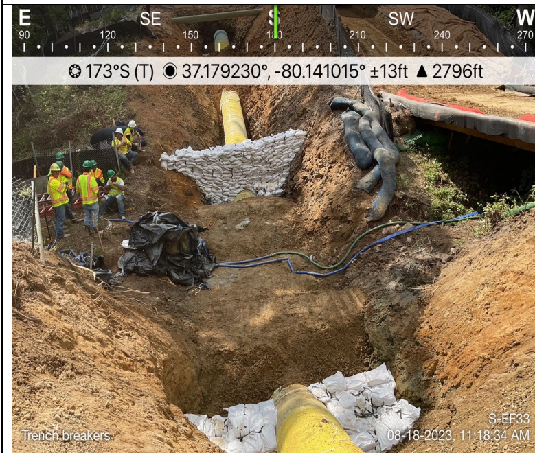
Photo Description: Trench breakers in progress, partial back fill, and dam and pump around active.