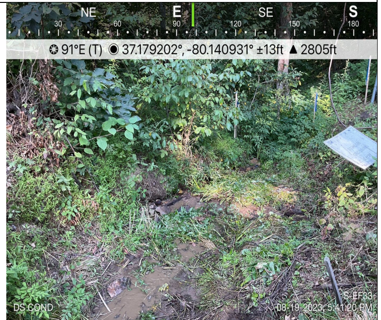
Photo Description: Downstream view of unpermitted area during post-construction assessment.