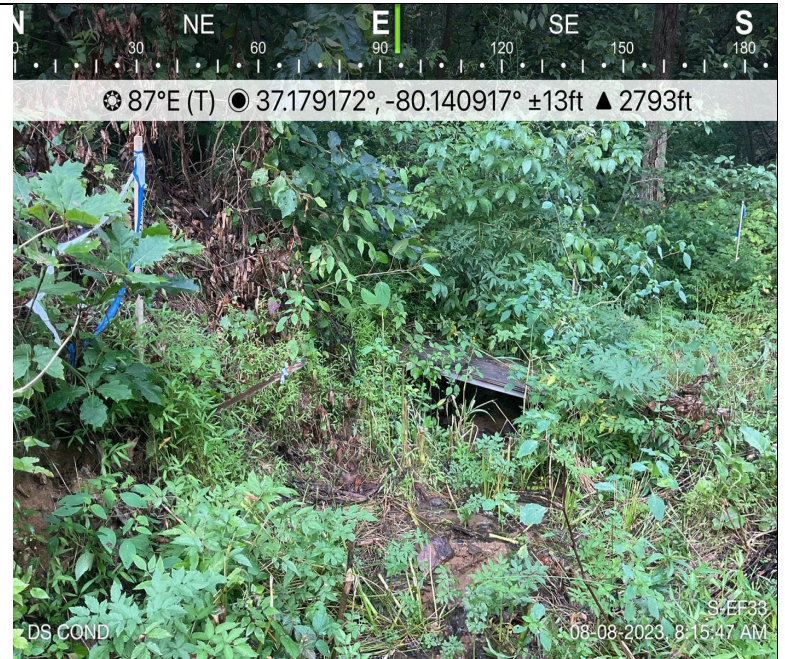
Photo Description: Downstream view of unpermitted area during pre-construction assessment.