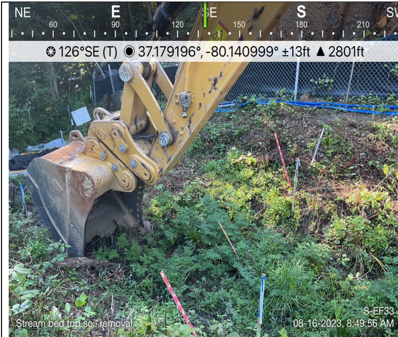
Photo Description: First scoop of stream bed top soil being removed.