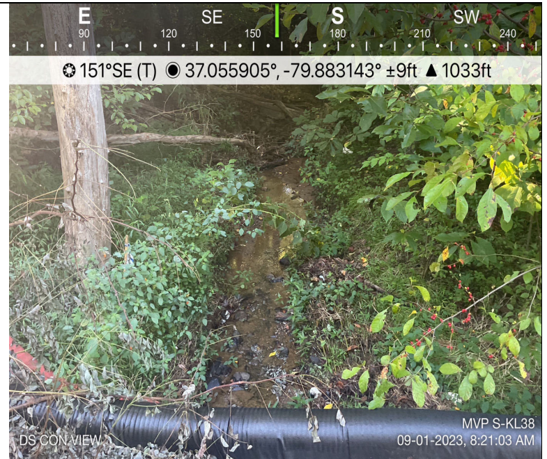
Photo Description: Conditions of the downstream area outside the ROW during pre-construction assessment.