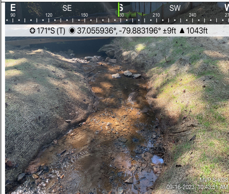
Photo Description: Downstream view of permitted impact area during post-construction assessment.