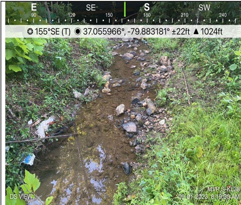
Photo Description: Downstream view of permitted impact area during pre-construction assessment.