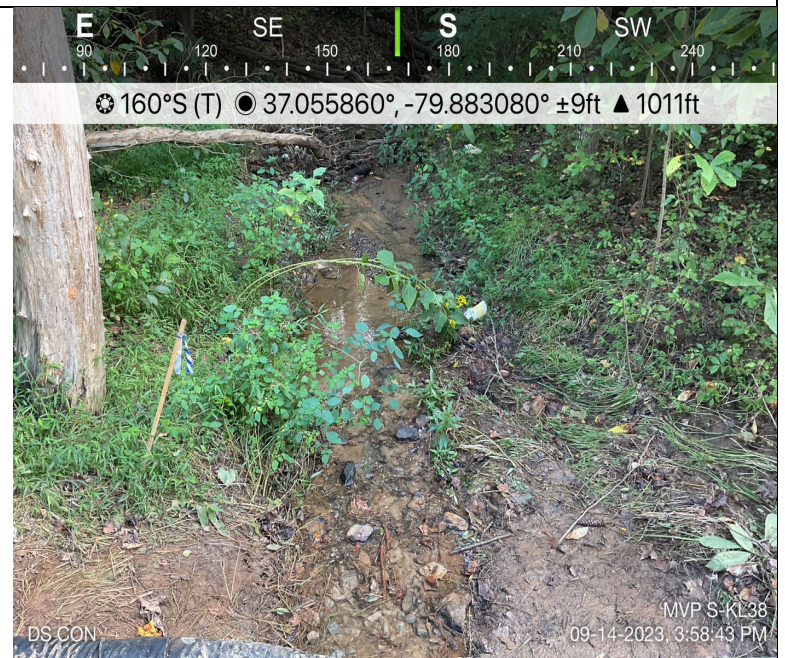
Photo Description: Conditions of the downstream area outside the ROW during post-construction assessment.