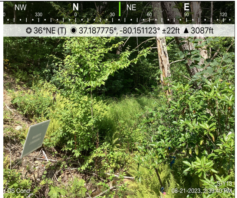
Photo Description: Conditions of the downstream area outside the ROW during pre-construction assessment.