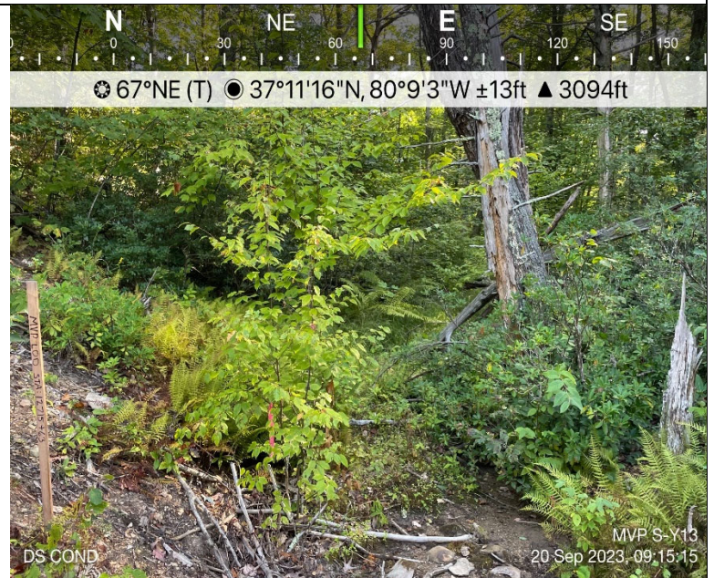
Photo Description: Conditions of the downstream area outside the ROW during post-construction assessment.