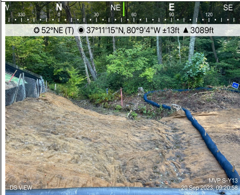
Photo Description: Downstream view of permitted impact area during post-construction assessment.