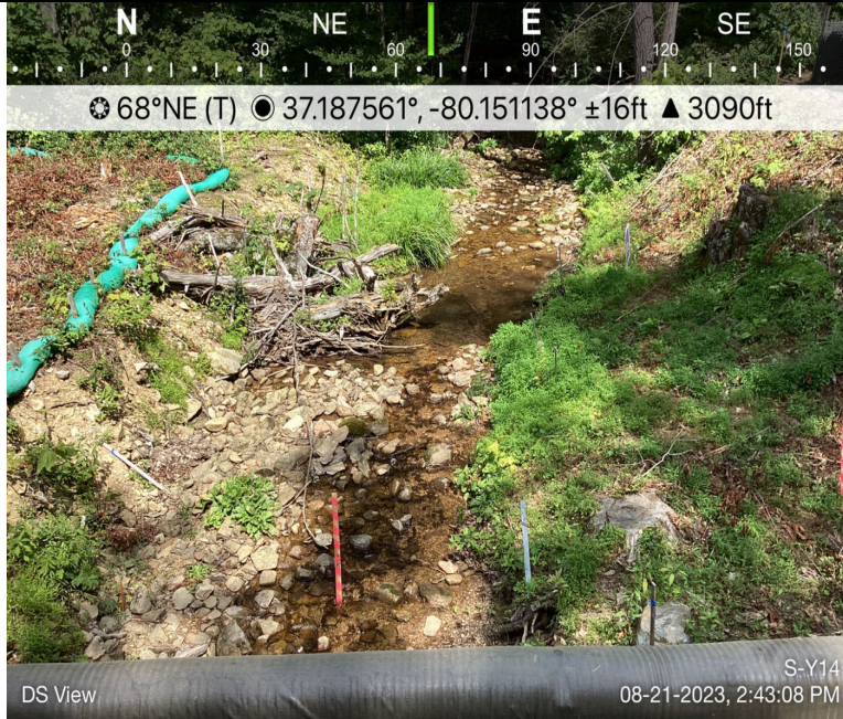
Photo Description: Downstream view of permitted impact area during pre-construction assessment.