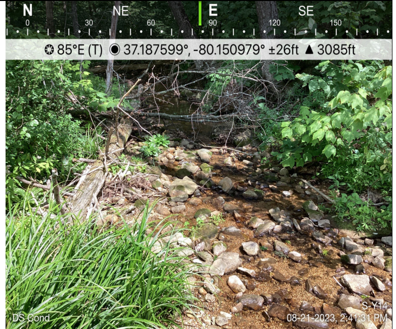
Photo Description: Conditions of the downstream area outside the ROW during pre-construction assessment.