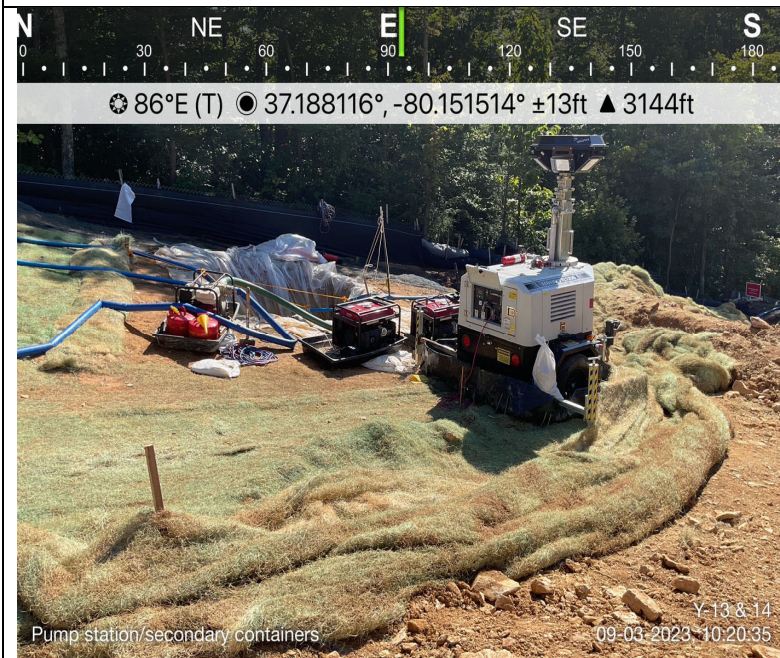
Photo Description: Dewatering pump station within secondary containment.