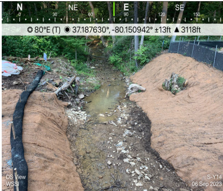
Photo Description: Downstream view of permitted impact area during post-construction assessment.