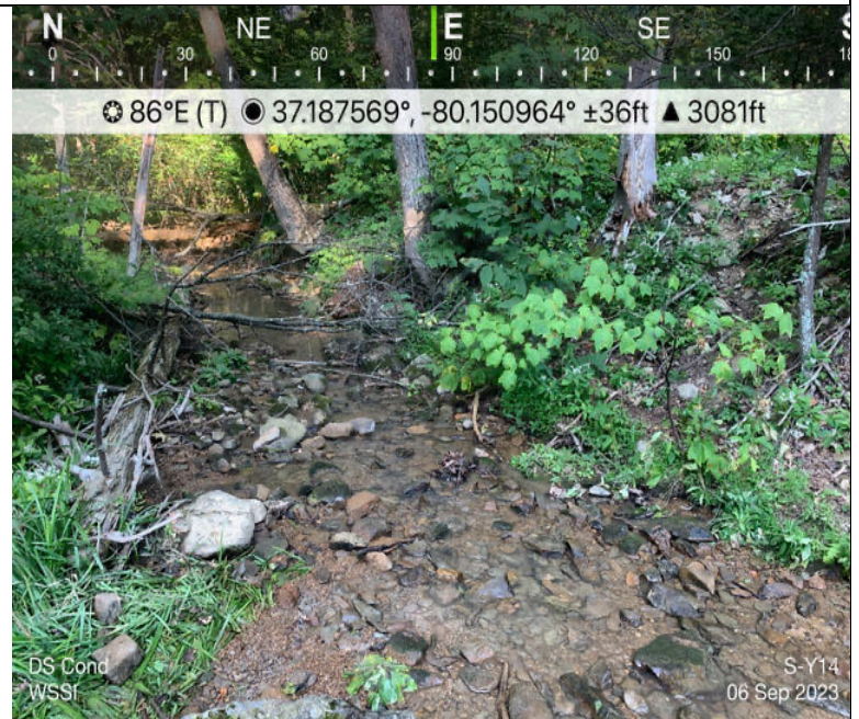
Photo Description: Conditions of the downstream area outside the ROW during post-construction assessment.