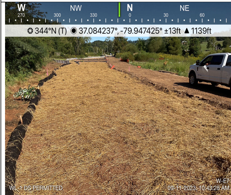
Photo Description: View of permitted resource impact area during post-construction assessment.