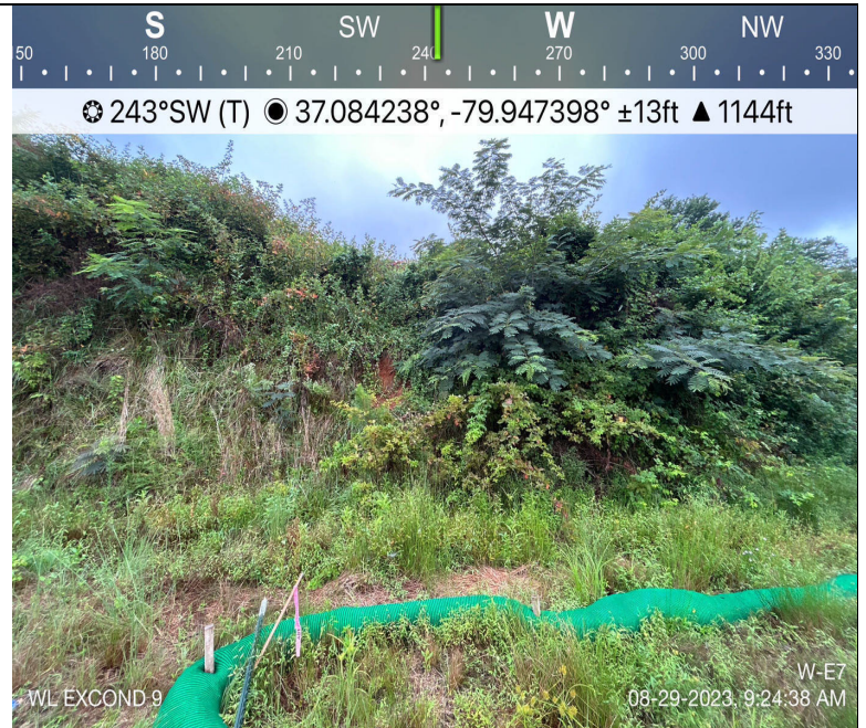
Photo Description: At edge of LOD, view of unpermitted resource area conditions during pre-construction assessment.