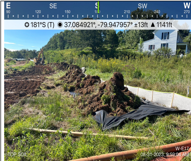
Photo Description: Wetland topsoil stockpiled on geo-fabric. Typo in photo watermark, resource depicted is *W-E7*