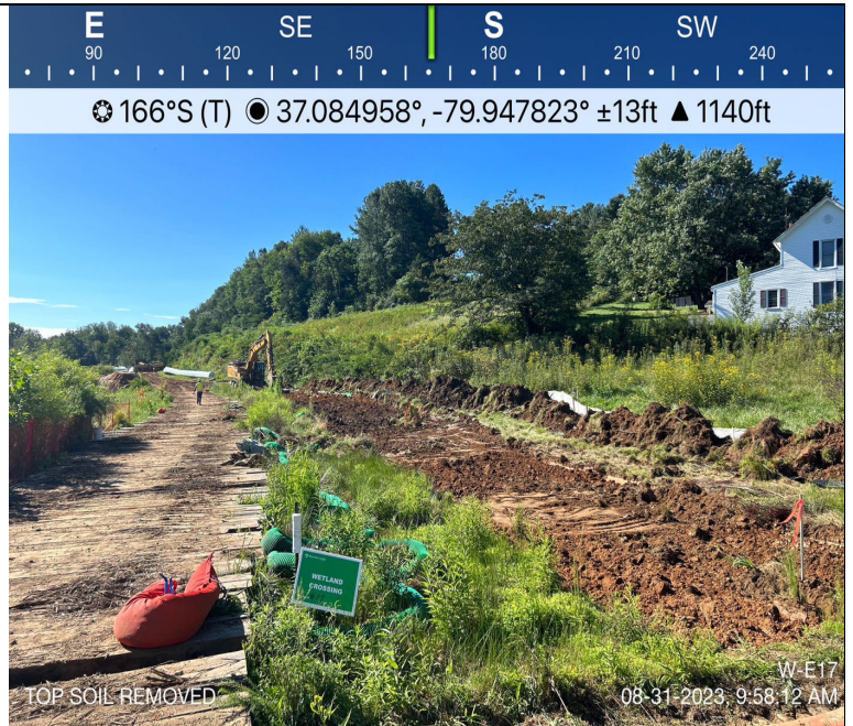
Photo Description: Topsoil stripping through wetland impact area. Typo in photo watermark, resource depicted is *W-E7*