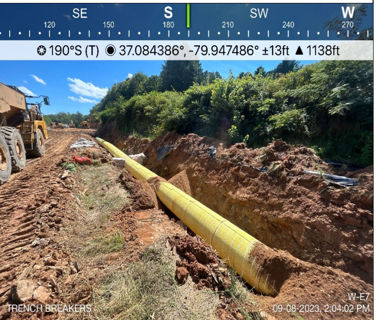
Photo Description: Pipe in trench, and trench breakers being installed.