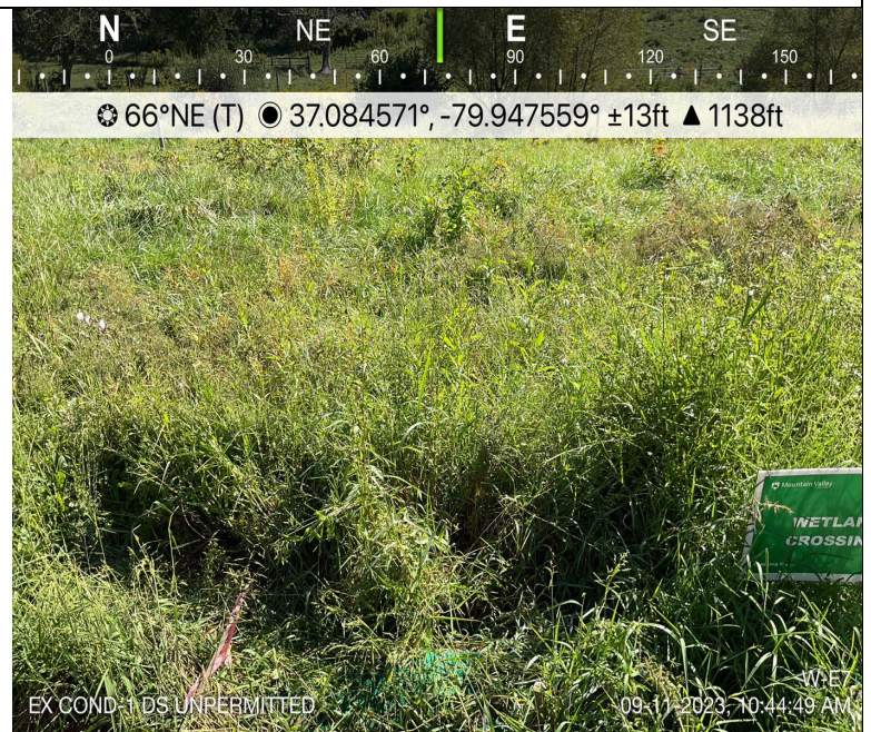
Photo Description: At edge of LOD, view of unpermitted resource area conditions during post-construction assessment.