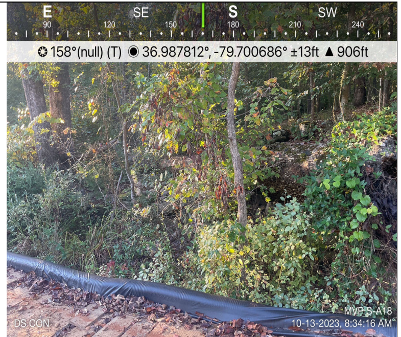
Photo Description: Conditions of the downstream area outside the ROW during pre-construction assessment.