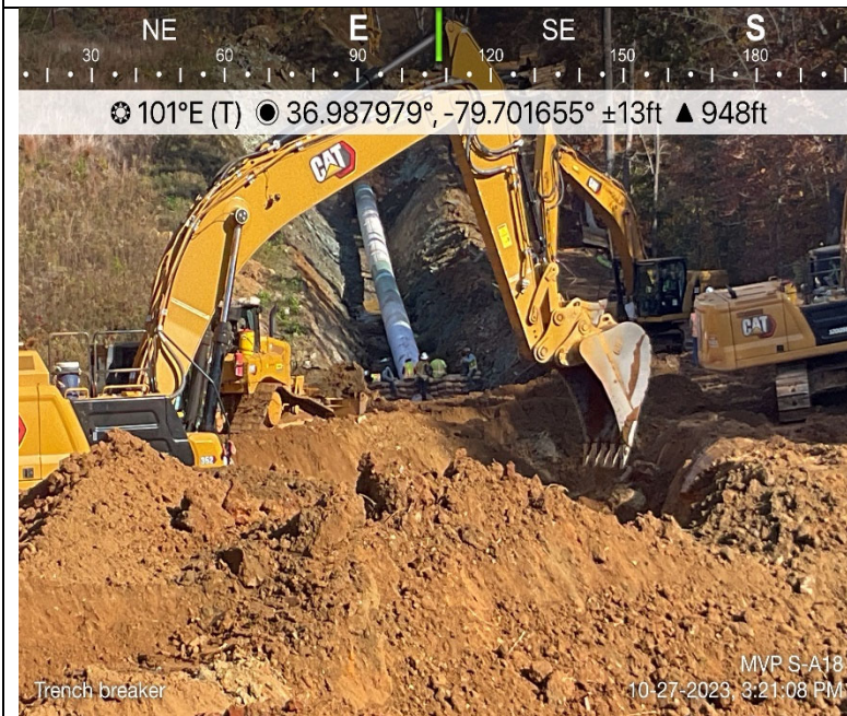
Photo Description: A trench breaker being installed along the pipe.