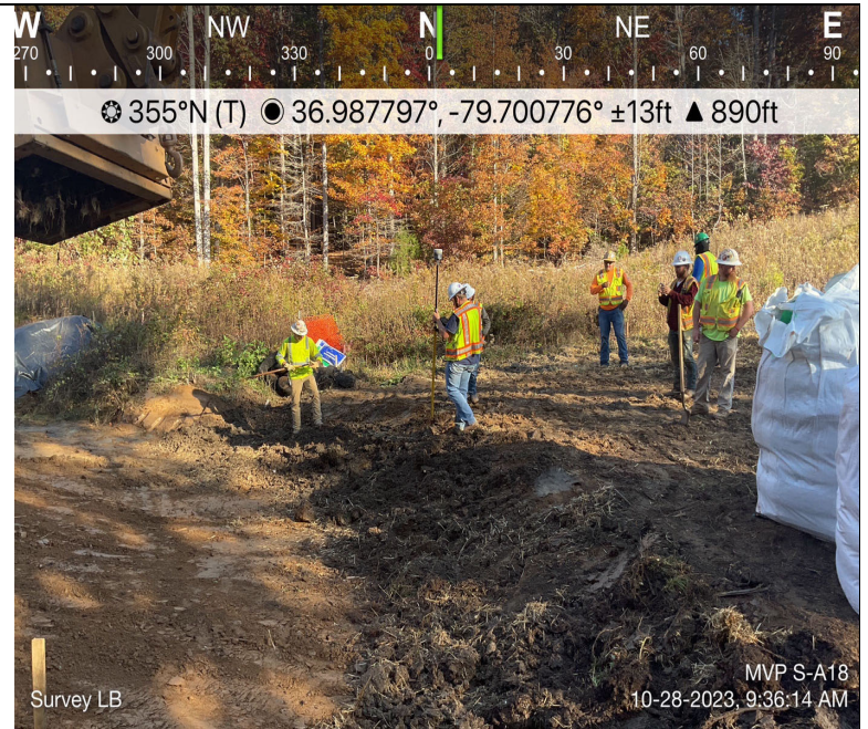
Photo Description: Survey aiding in the reconstruction of the left stream bank.