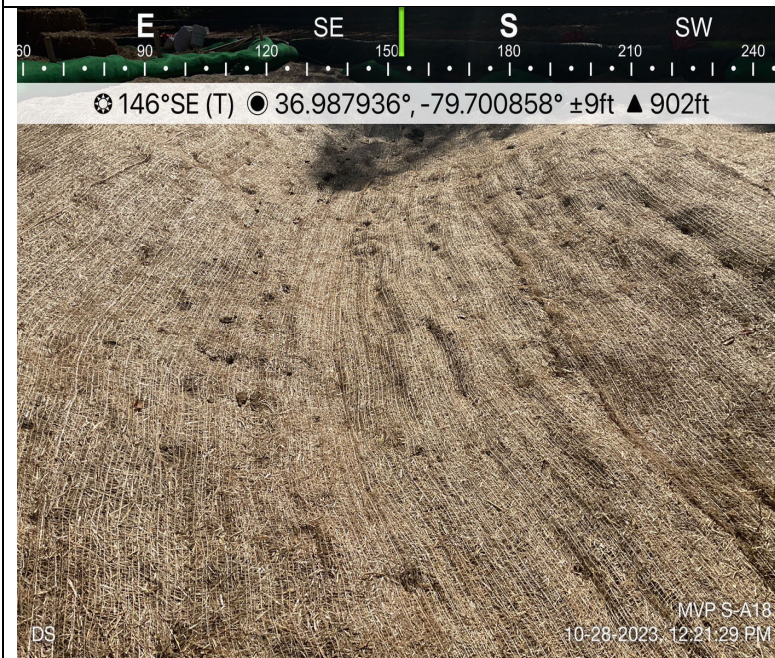
Photo Description: Downstream view of permitted impact area during post-construction assessment.