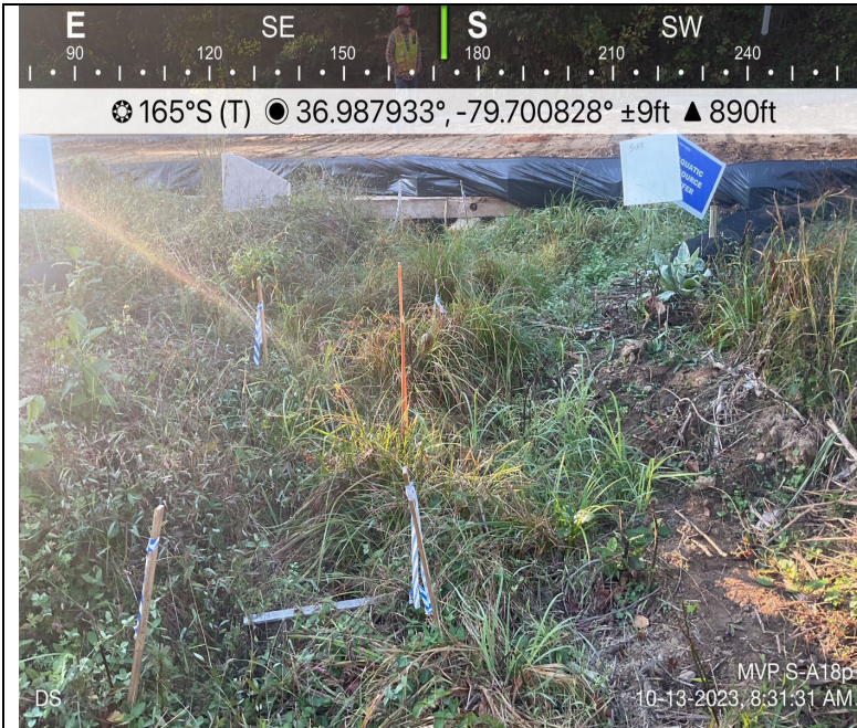
Photo Description: Downstream view of permitted impact area during pre-construction assessment.