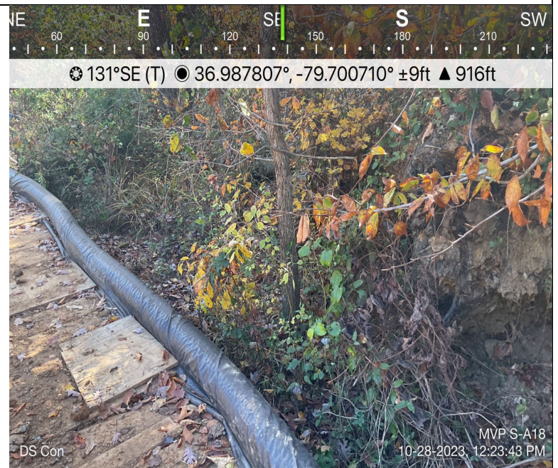
Photo Description: Conditions of the downstream area outside the ROW during post-construction assessment.