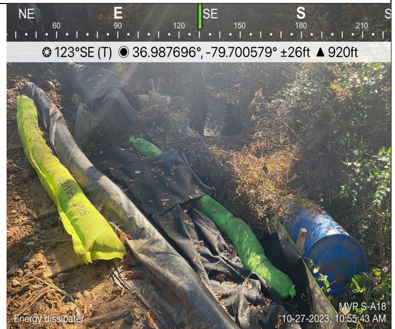
Photo Description: An energy dissipater utilized during construction.