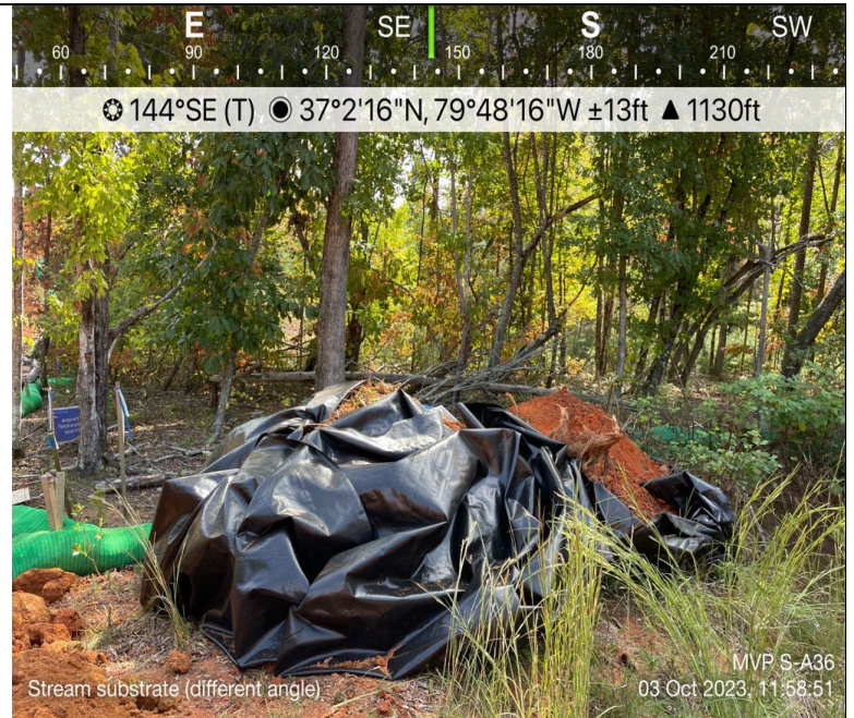
Photo Description: First and last 6 inches of stream substrate separated on Geotech