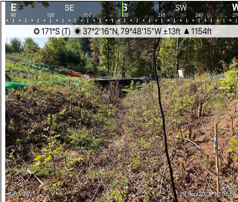
Photo Description: Downstream view of permitted impact area during pre-construction assessment. Typo in photo caption. Should read "DS VIEW", not "US VIEW".