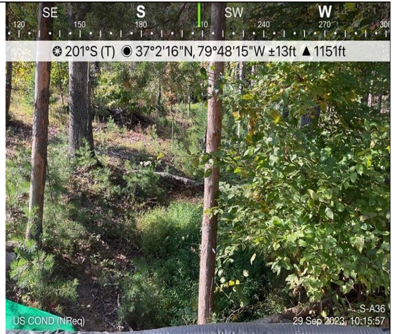
Photo Description: Conditions of the downstream area outside the ROW during pre-construction assessment. Typo in photo caption. Should read "DS COND", not "US COND".