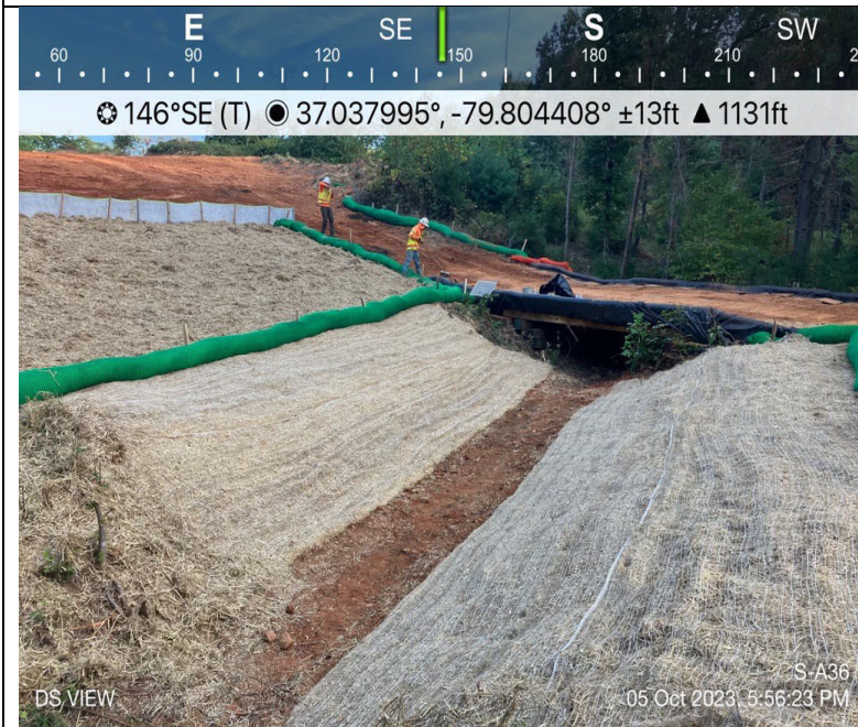
Photo Description: Downstream view of permitted impact area during post-construction assessment.