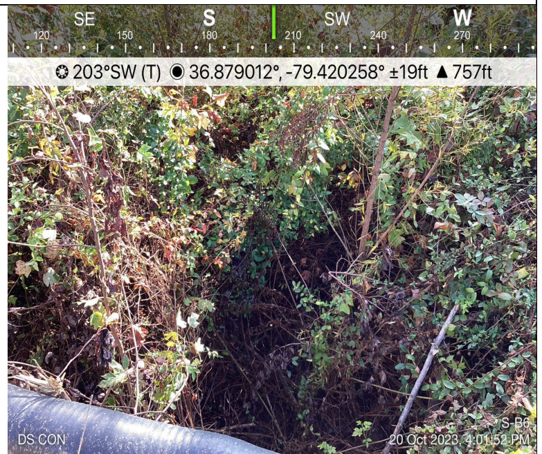
Photo Description: Conditions of the downstream area outside the ROW during post-construction assessment.