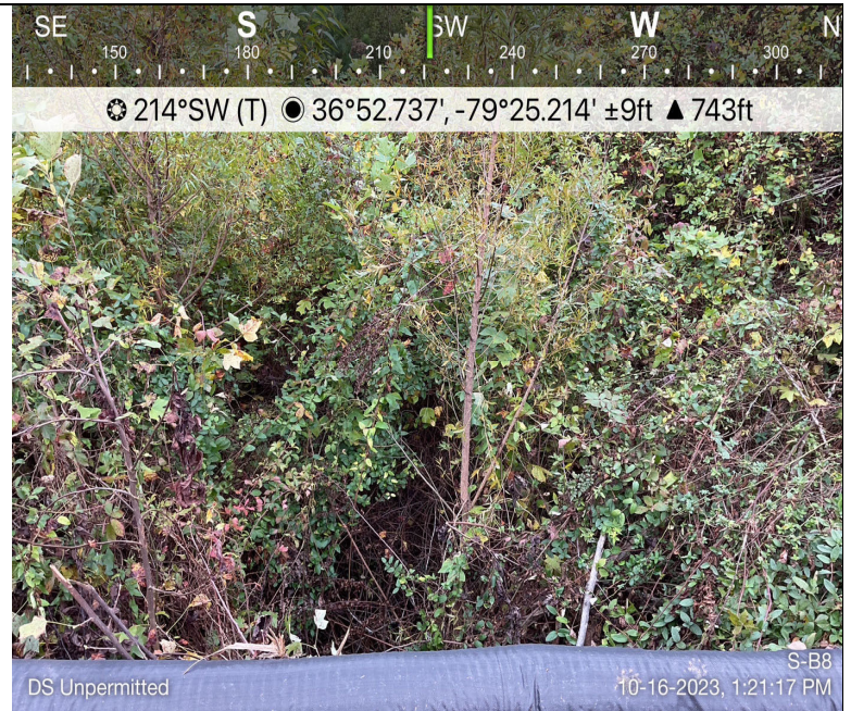
Photo Description: Conditions of the downstream area outside the ROW during pre-construction assessment.