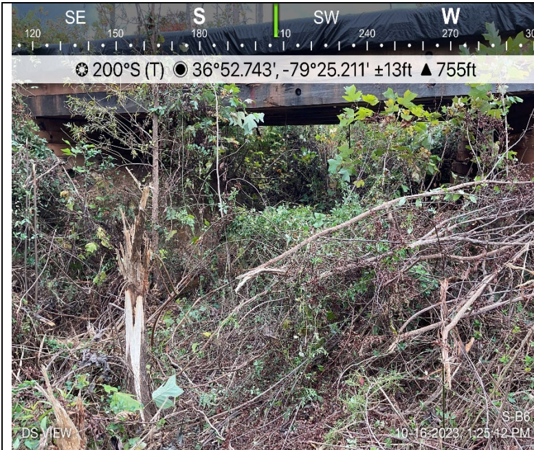
Photo Description: Downstream view of permitted impact area during pre-construction assessment.