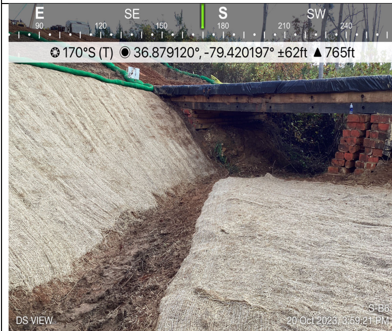
Photo Description: Downstream view of permitted impact area during post-construction assessment.