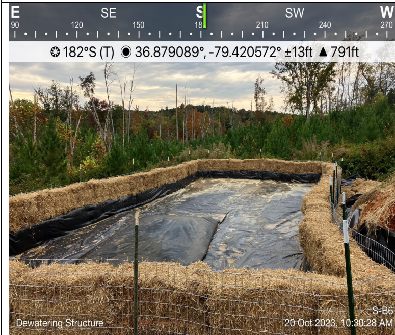
Photo Description: The dewatering structure utilized for the water in the trench.