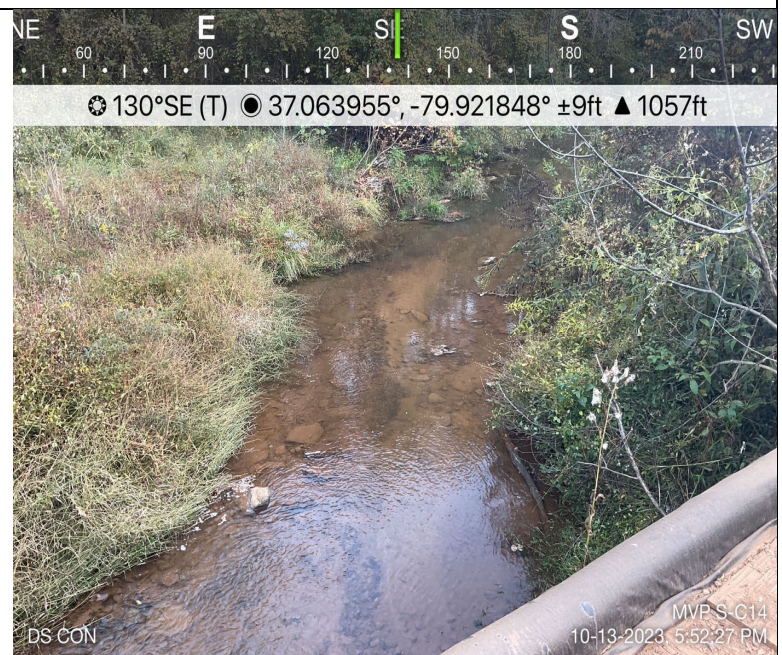
Photo Description: Conditions of the downstream area outside the ROW during post-construction assessment.