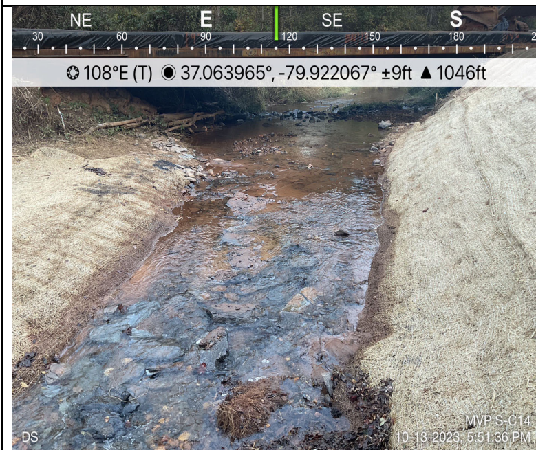
Photo Description: Downstream view of permitted impact area during post-construction assessment.