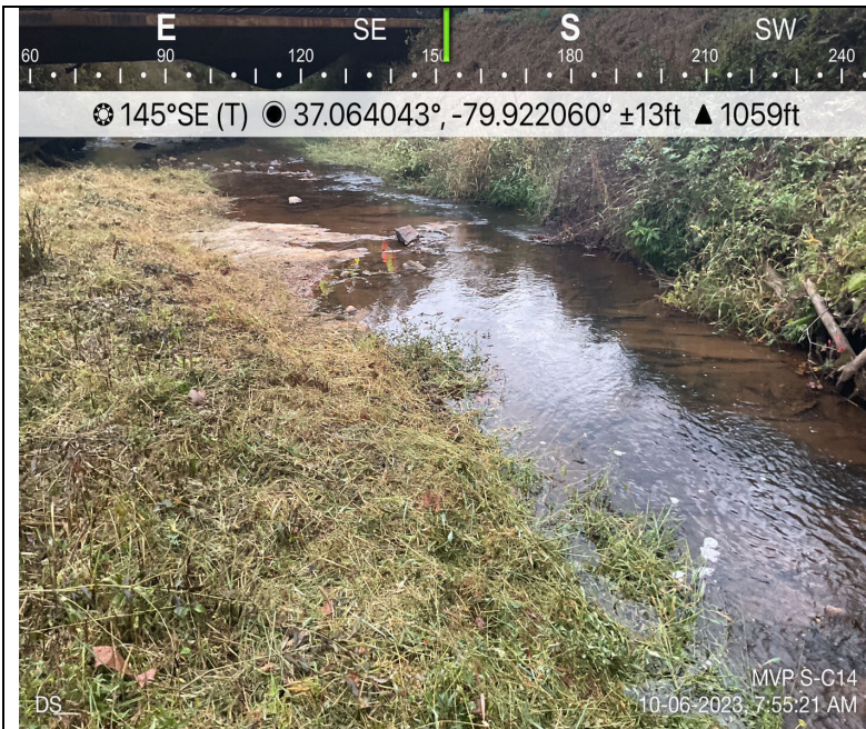
Photo Description: Downstream view of permitted impact area during pre-construction assessment.