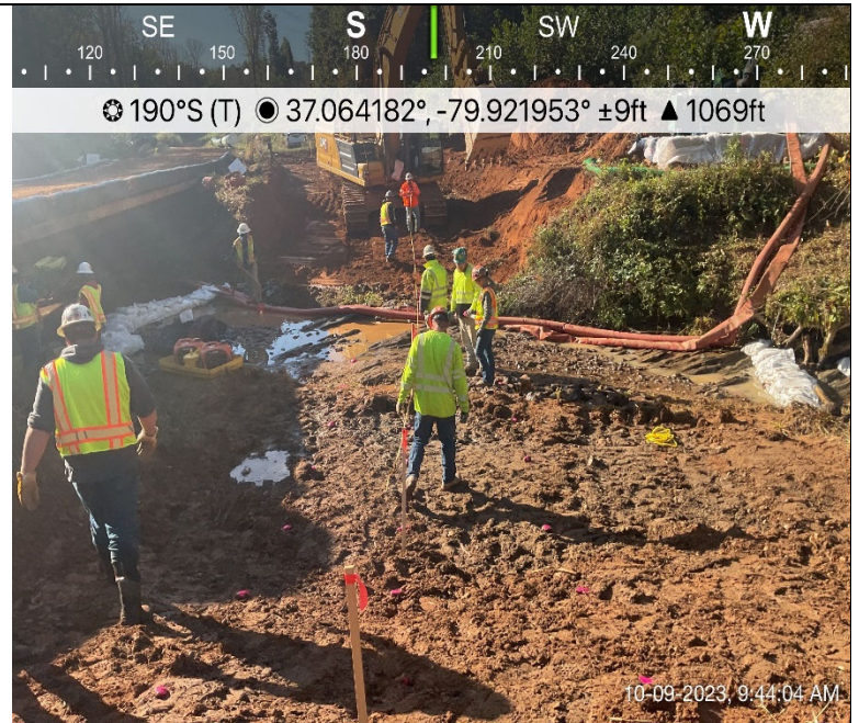
Photo Description: Crossing area preparation after topsoil/substrate removal.