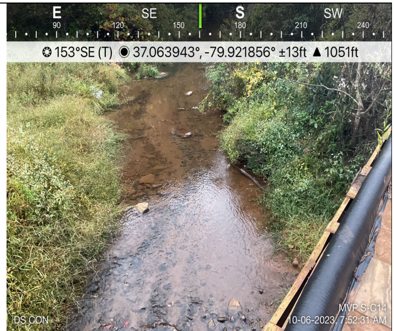
Photo Description: Conditions of the downstream area outside the ROW during pre-construction assessment.