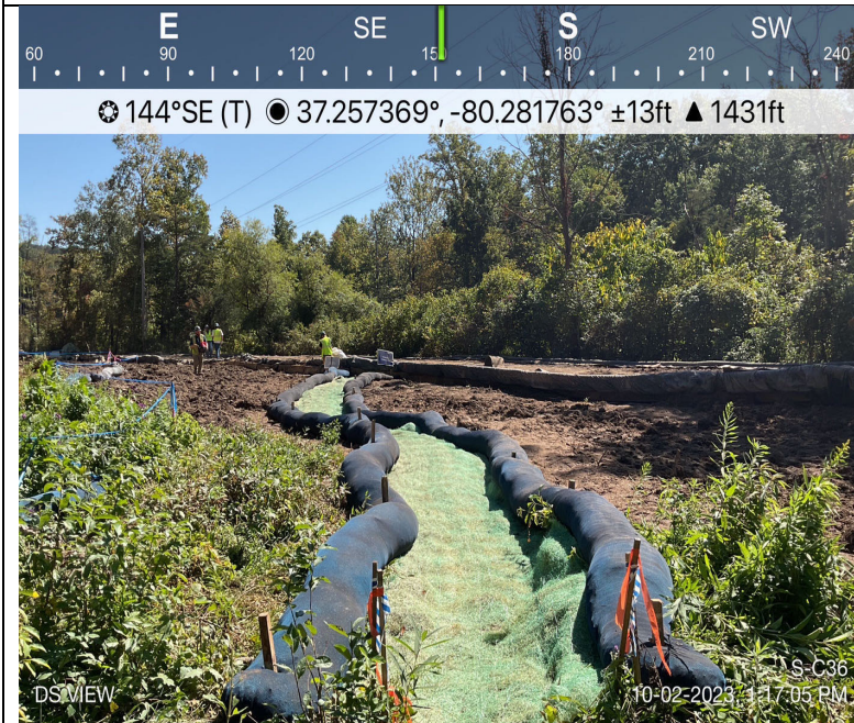
Photo Description: Downstream view of permitted impact area during post-construction assessment.