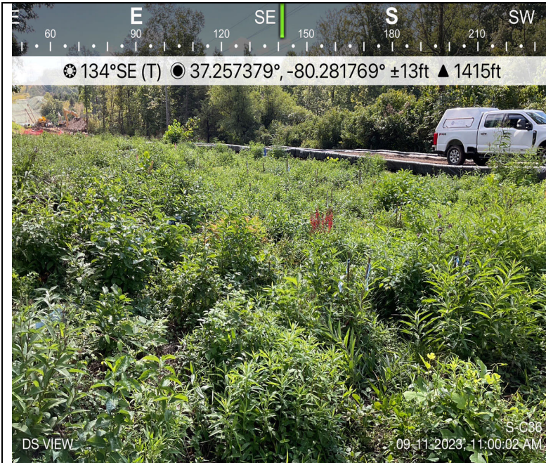
Photo Description: Downstream view of permitted impact area during pre-construction assessment.