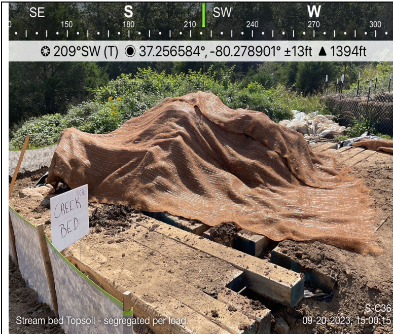
Photo Description: Stream bed material segregation and stabilization.