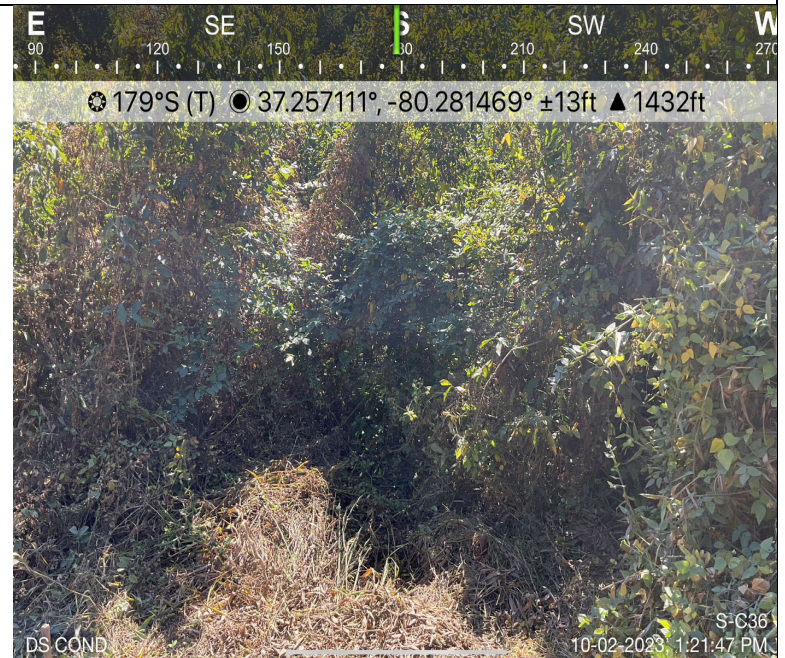
Photo Description: Conditions of the downstream area outside the ROW during post-construction assessment.