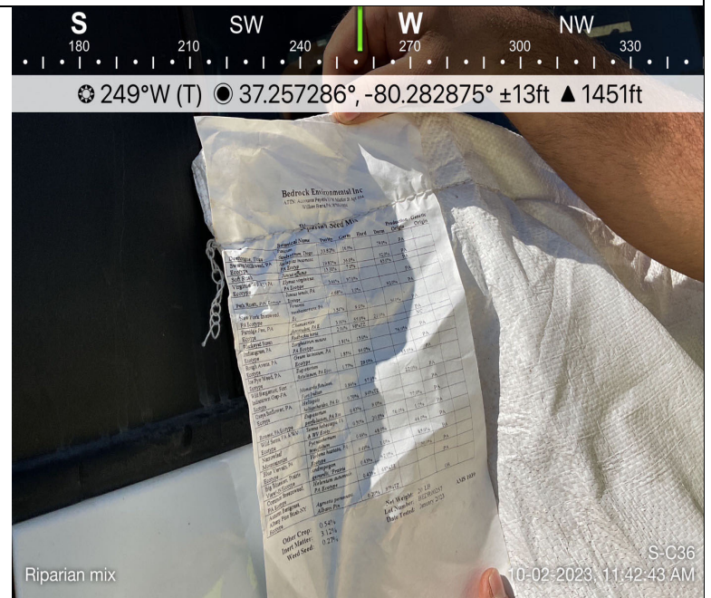
Photo Description: Stream seed tag for restoration and stabilization.