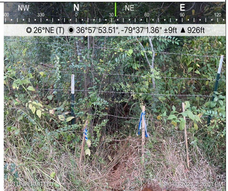
Photo Description: Conditions of the downstream area outside the ROW during post-construction assessment.