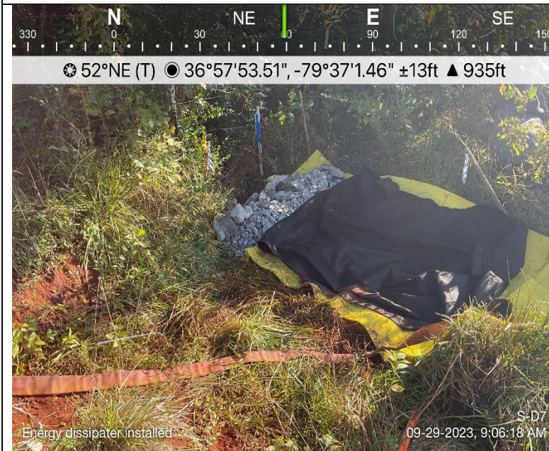
Photo Description: Dam and pump downstream outlet and energy dissipation.