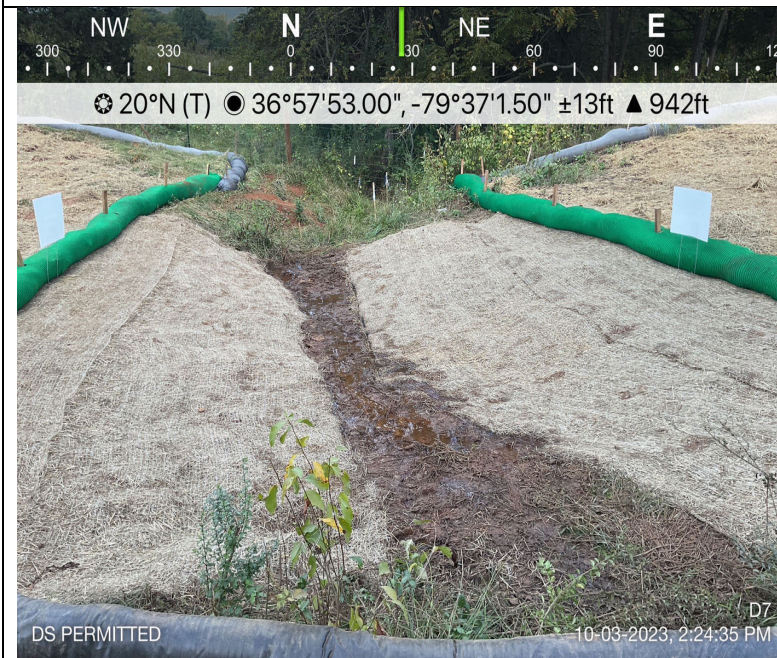
Photo Description: Downstream view of permitted impact area during post-construction assessment.