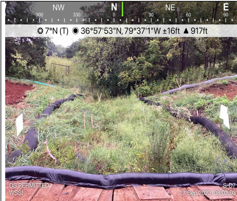
Photo Description: Downstream view of permitted impact area during pre-construction assessment.