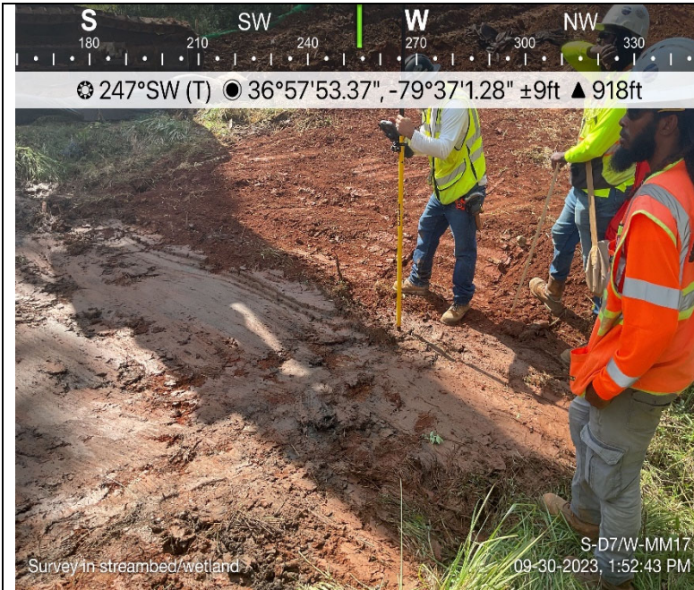
Photo Description: Survey crews stake out of pre-existing conditions for restoration purposes.