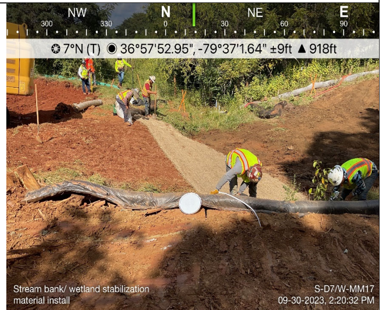
Photo Description: Restoration crews applying seed and stabilization matting to impacted resource areas.