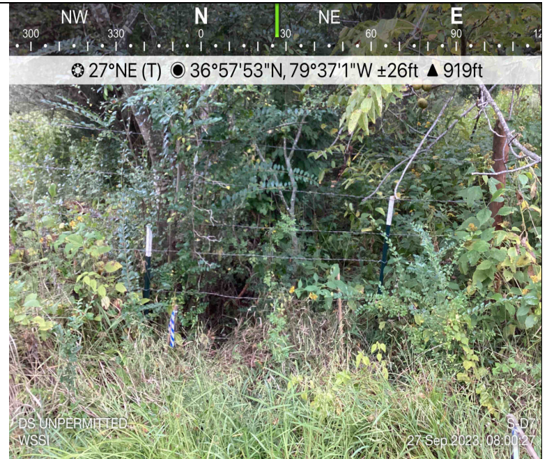
Photo Description: Conditions of the downstream area outside the ROW during pre-construction assessment.