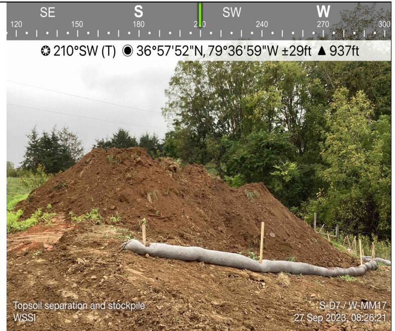
Photo Description: Buffer zone topsoil stockpiled separately from subsoil.