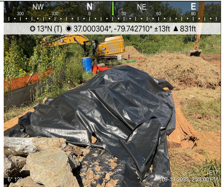
Photo Description: Streambed material stockpiled separately from subsoil.