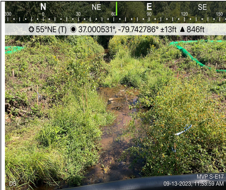
Photo Description: Downstream view of permitted impact area during pre-construction assessment.