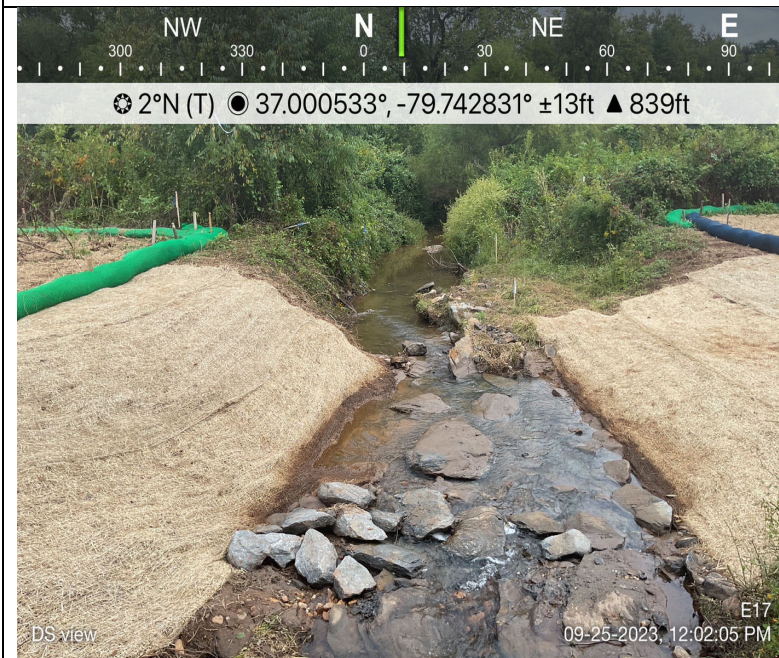
Photo Description: Downstream view of permitted impact area during post-construction assessment.