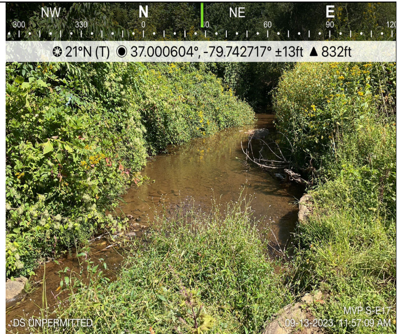
Photo Description: Conditions of the downstream area outside the ROW during pre-construction assessment.