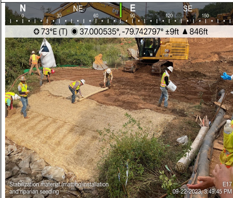
Photo Description: Bank restoration with riparian seed mix and erosion control matting.