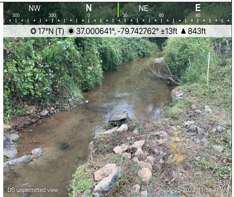
Photo Description: Conditions of the downstream area outside the ROW during post-construction assessment.