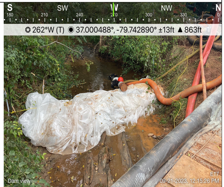
Photo Description: View of upstream dam for pump around operation.