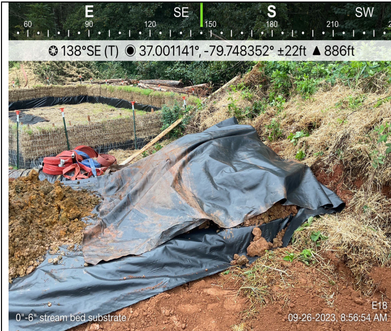
Photo Description: Stream substrate 0-6" stream segregated and stockpiled separately from subsoil