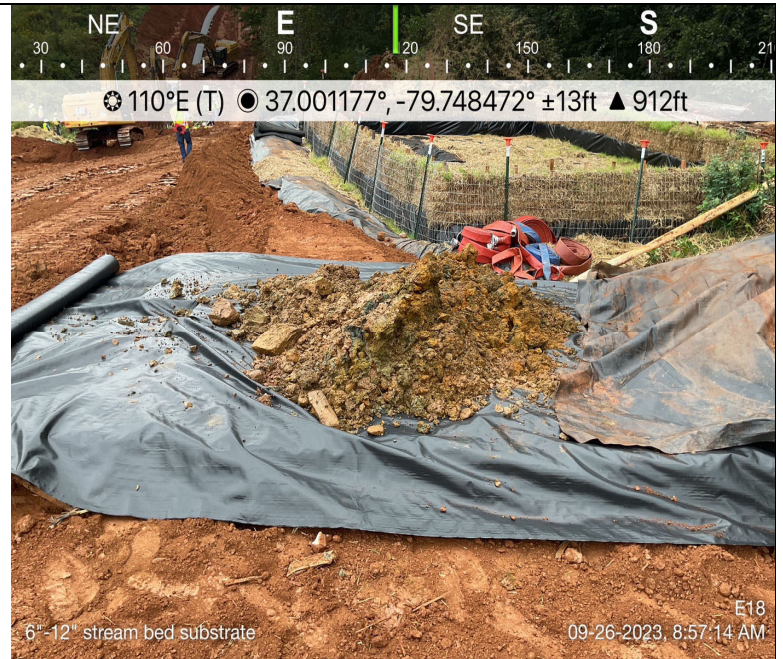
Photo Description: Stream topsoil layer (6-12") segregated and stockpiled separately from subsoil.