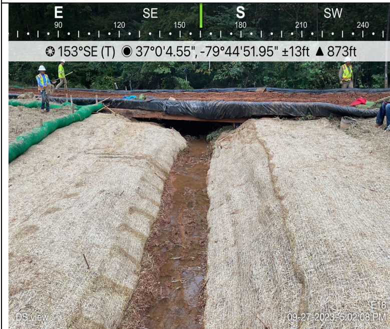
Photo Description: Downstream view of permitted impact area during post-construction assessment.