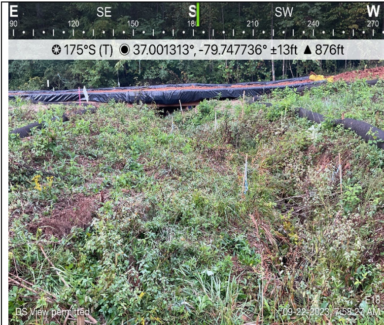
Photo Description: Downstream view of permitted impact area during pre-construction assessment.