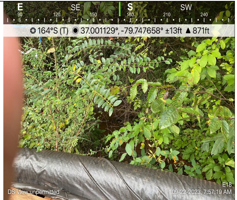
Photo Description: Conditions of the downstream area outside the ROW during pre-construction assessment.