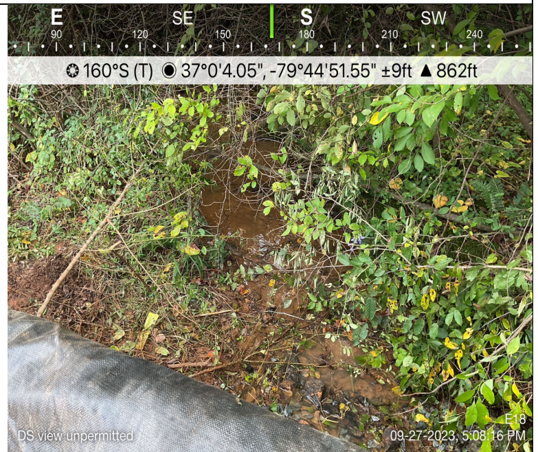
Photo Description: Conditions of the downstream area outside the ROW during post-construction assessment.