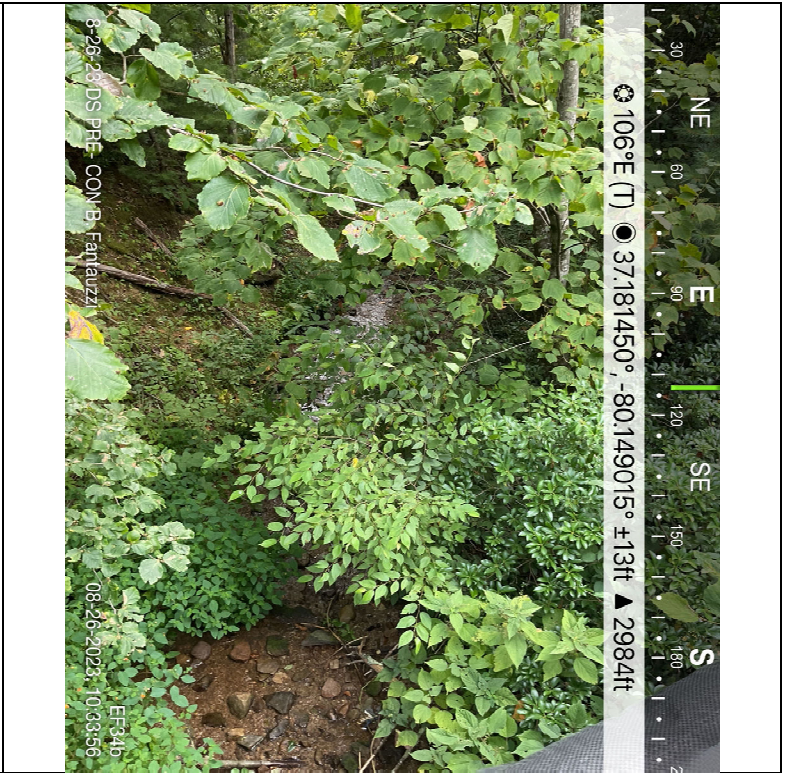
Photo Description: Conditions of the downstream area outside the ROW during pre-construction assessment. Landscape mode malfunction on Solocator App