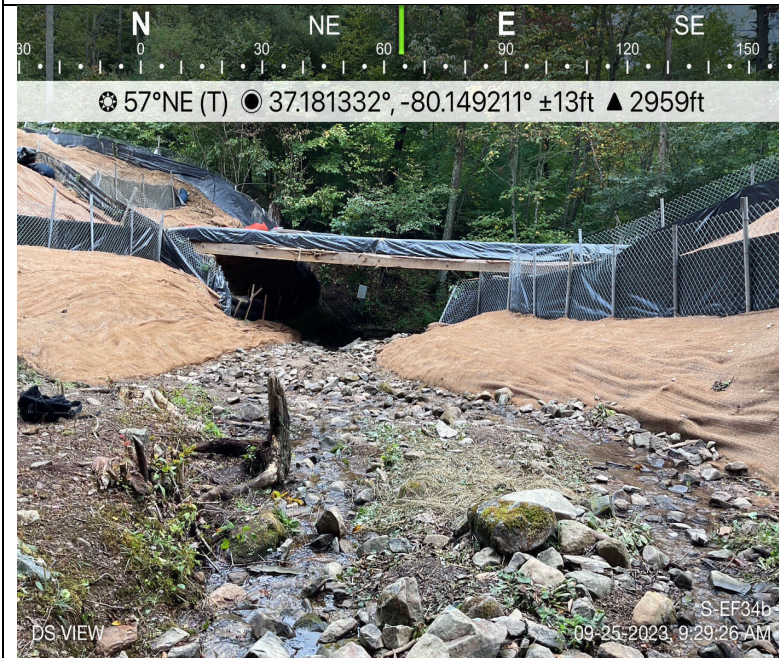
Photo Description: Downstream view of permitted impact area during post-construction assessment.