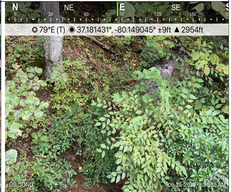
Photo Description: Conditions of the downstream area outside the ROW during post-construction assessment.