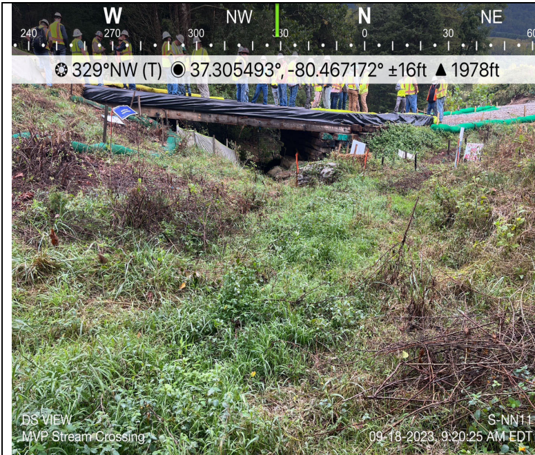
Photo Description: Downstream view of permitted impact area during pre-construction assessment.