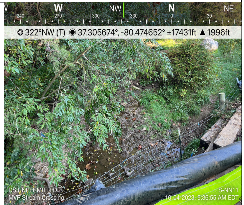
Photo Description: Conditions of the downstream area outside the ROW during post-construction assessment.