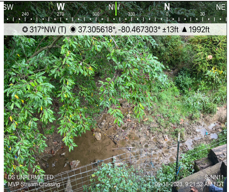
Photo Description: Conditions of the downstream area outside the ROW during pre-construction assessment.