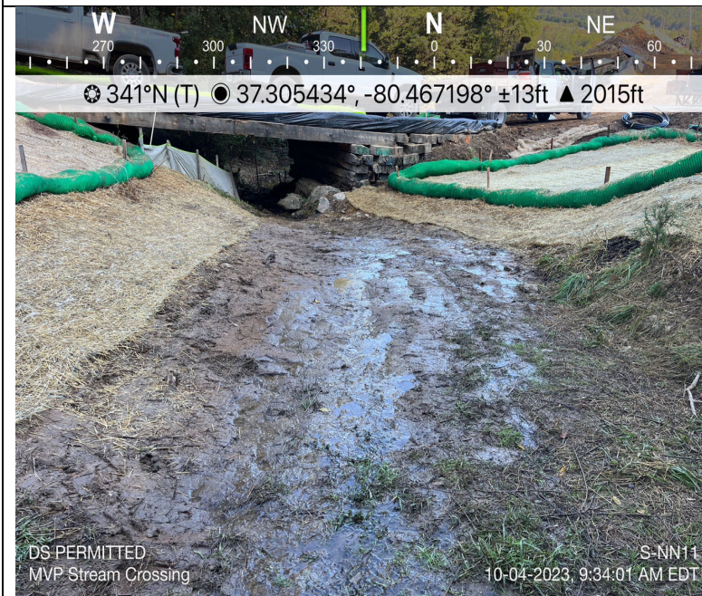
Photo Description: Downstream view of permitted impact area during post-construction assessment.