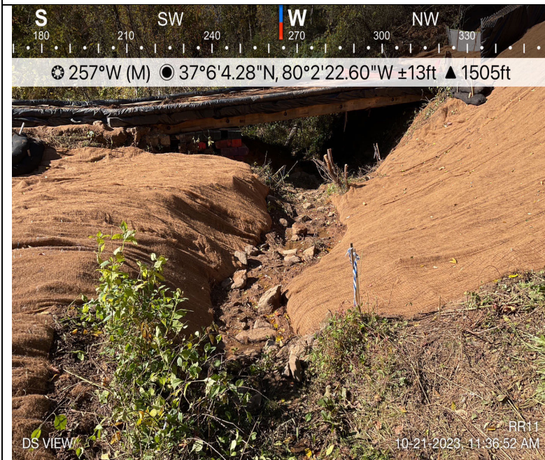
Photo Description: Downstream view of permitted impact area during post-construction assessment.