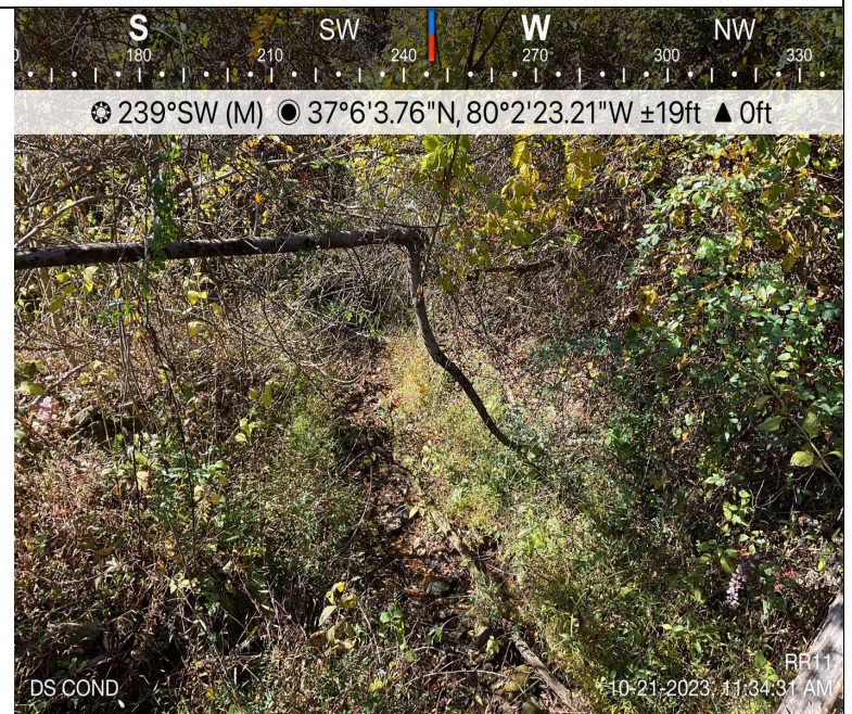
Photo Description: Conditions of the downstream area outside the ROW during post-construction assessment.