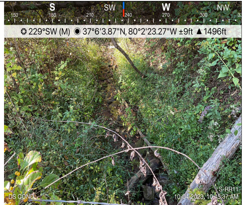
Photo Description: Conditions of the downstream area outside the ROW during pre-construction assessment.