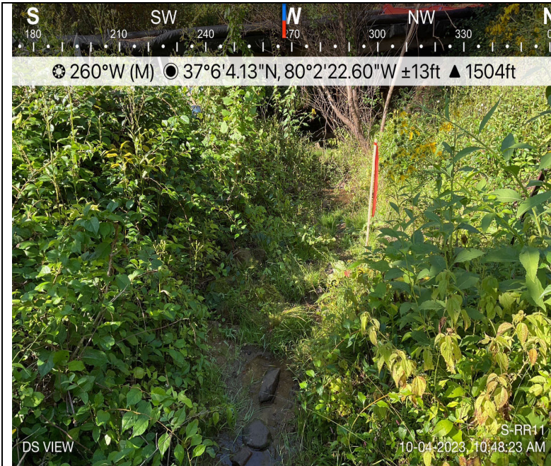
Photo Description: Downstream view of permitted impact area during pre-construction assessment.