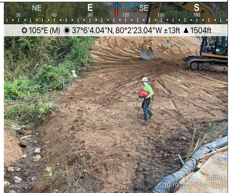
Photo Description: Restoration crews applying seed mixes to disturbed resource area.