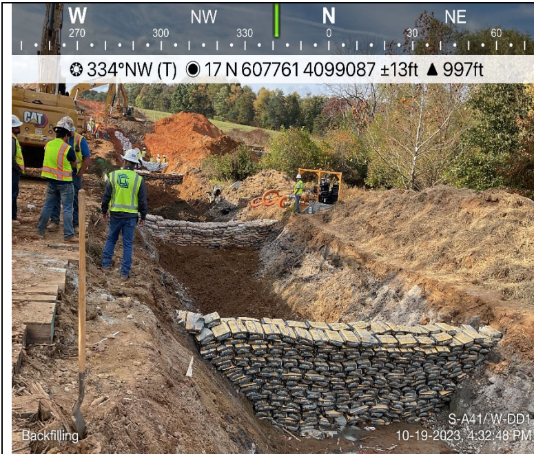
Photo Description: Trenchbreaker installations and pipe padding backfill.