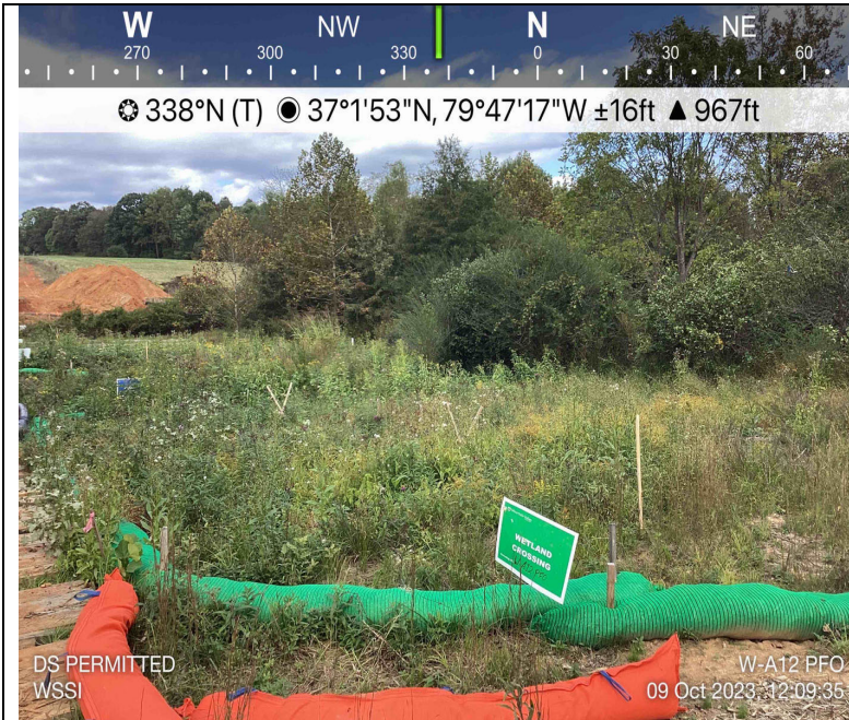
Photo Description: View of permitted resource impact area during pre-construction assessment. Typo in photo watermark. W-A12-PEM, not PFO.