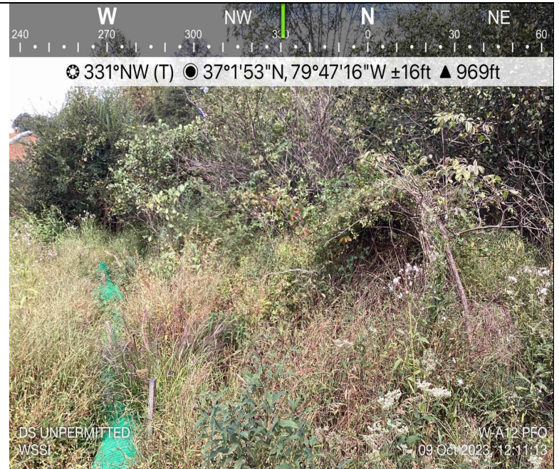
Photo Description: At edge of LOD, view of unpermitted resource area conditions during pre-construction assessment. Typo in photo watermark. W-A12-PEM, not PFO.