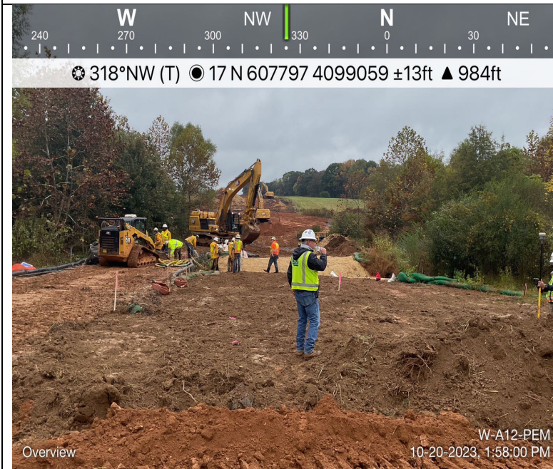
Photo Description: Restoration of the wetland's subsoil and topsoil.