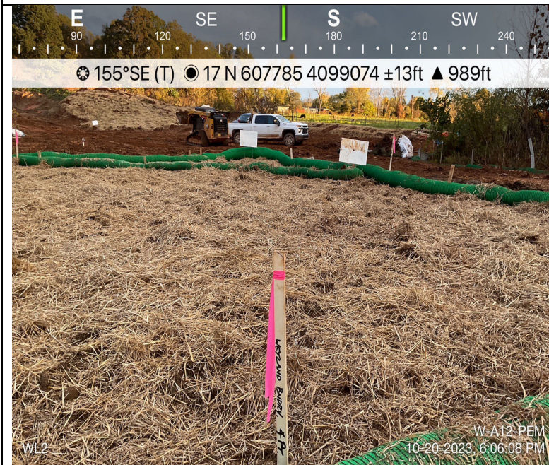
Photo Description: View of permitted resource impact area during post-construction assessment.