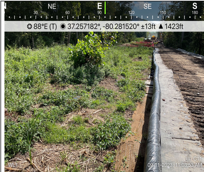
Photo Description: View of permitted resource impact area during pre-construction assessment.