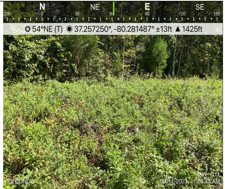
Photo Description: At edge of LOD, view of unpermitted resource area conditions during pre-construction assessment.