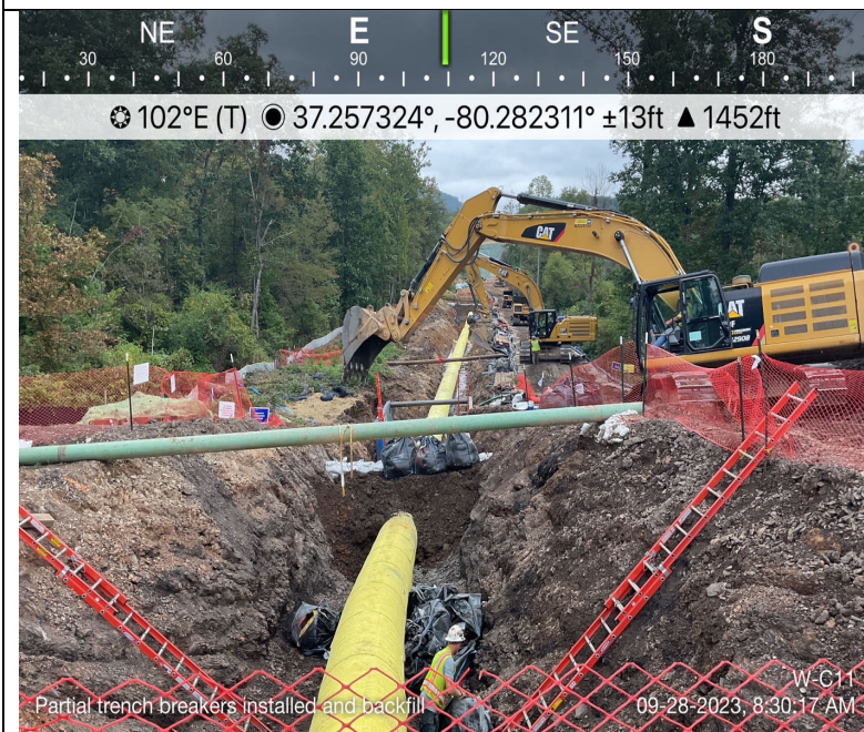
Photo Description: Trench breakers installed within 25 ft of resources.