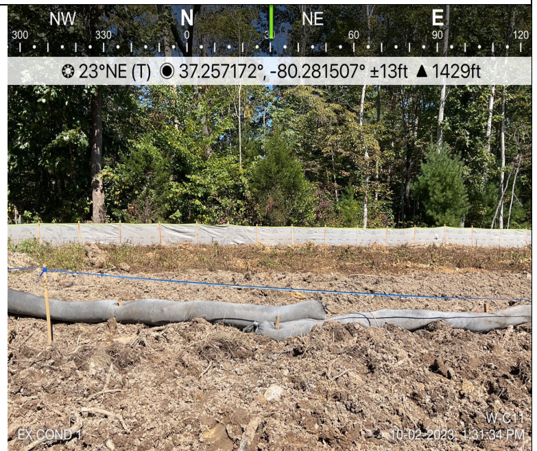
Photo Description: At edge of LOD, view of unpermitted resource area conditions during post-construction assessment.