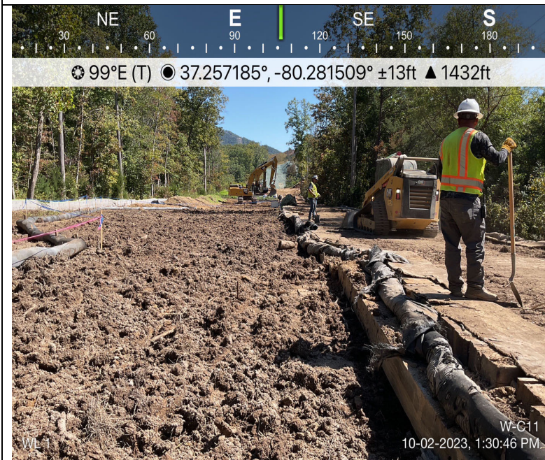
Photo Description: View of permitted resource impact area during post-construction assessment.