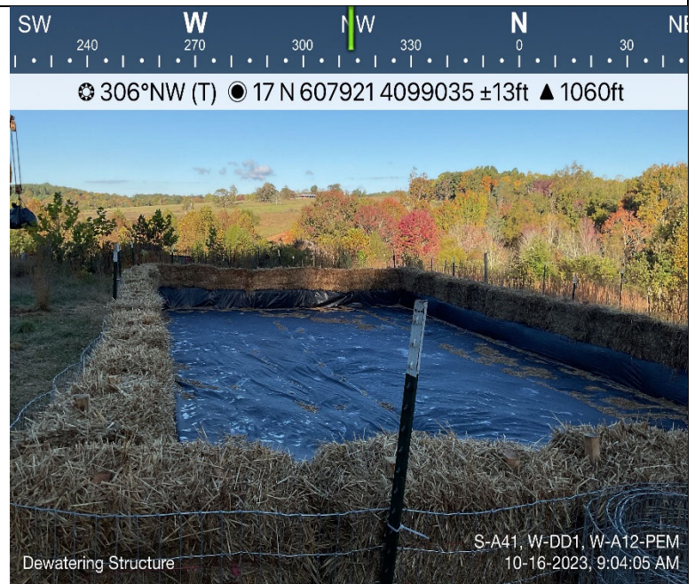
Photo Description: Dewatering structure installed for crossing activities at S-A41, W-A12-PEM & W-DD1.