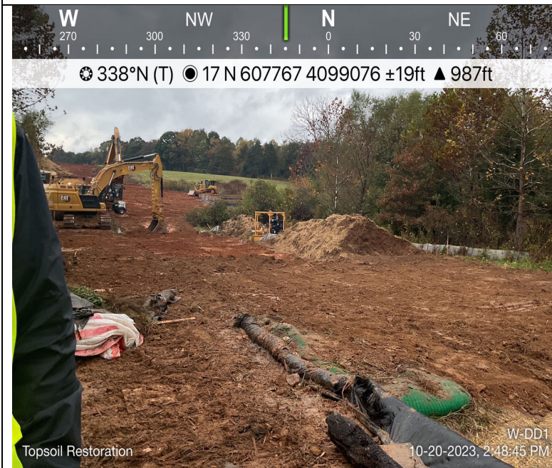
Photo Description: Restoration of the stockpiled topsoil to the impacted area.