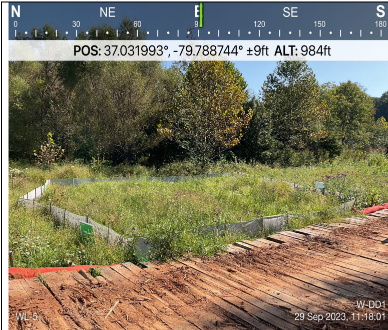
Photo Description: View of permitted resource impact area during pre-construction assessment.