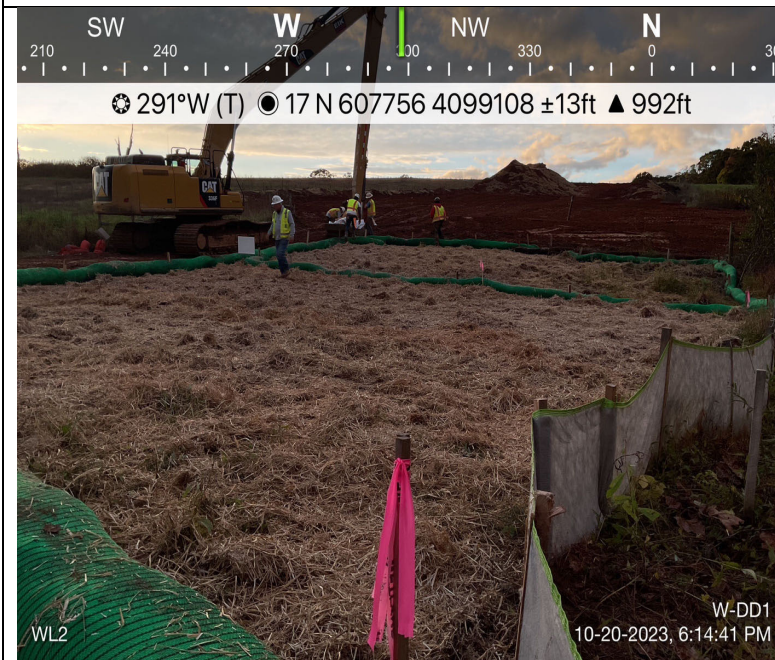
Photo Description: View of permitted resource impact area during post-construction assessment.