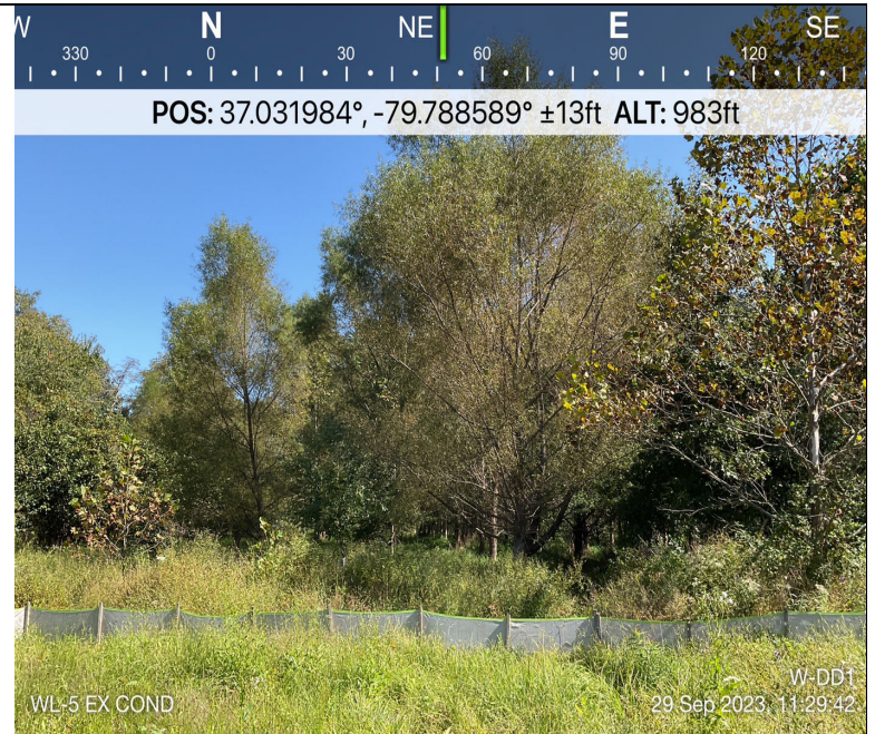
Photo Description: At edge of LOD, view of unpermitted resource area conditions during pre-construction assessment.