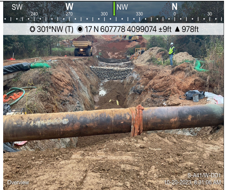
Photo Description: Trench breakers installed in W-DD1. Backfilling operations underway.