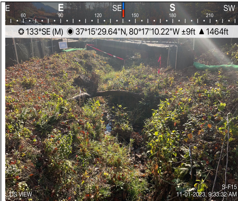
Photo Description: Downstream view of permitted impact area during pre-construction assessment.