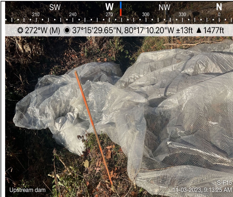
Photo Description: Upstream dam installed and functioning properly