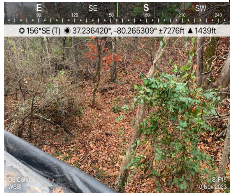
Photo Description: Conditions of the downstream area outside the ROW during post-construction assessment.