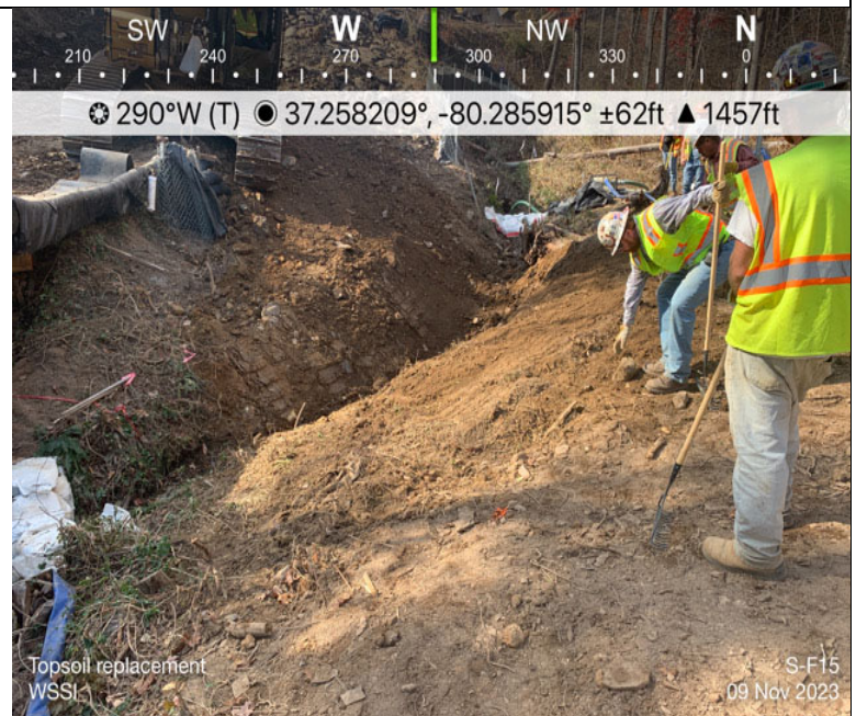
Photo Description: Restoration of the topsoil and survey as-builts.