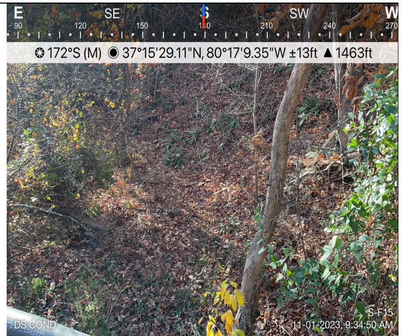
Photo Description: Conditions of the downstream area outside the ROW during pre-construction assessment.