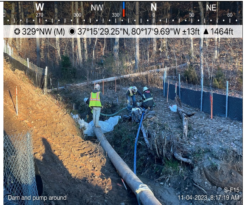
Photo Description: Flume installed. The dam and pump around was utilized when stream work was active.