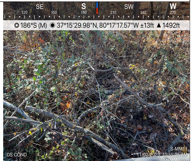
Photo Description: Conditions of the downstream area outside the ROW during post-construction assessment.