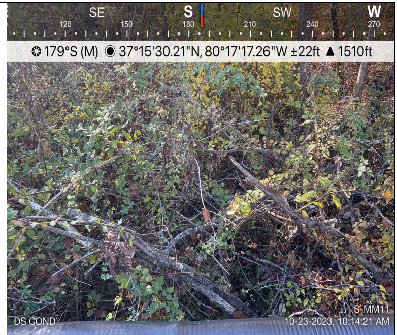
Photo Description: Conditions of the downstream area outside the ROW during pre-construction assessment.