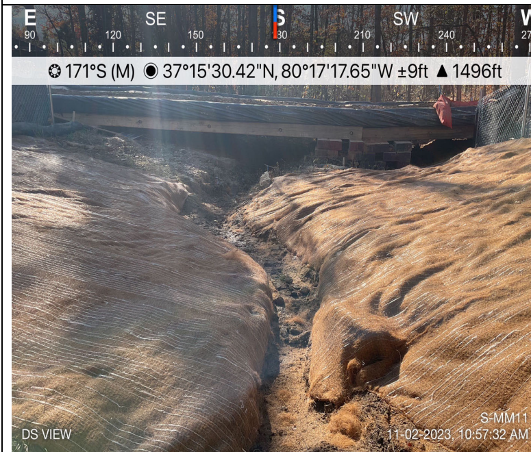
Photo Description: Downstream view of permitted impact area during post-construction assessment.