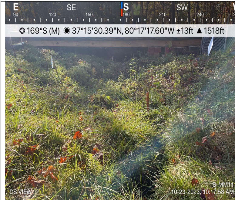
Photo Description: Downstream view of permitted impact area during pre-construction assessment.