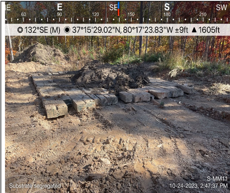
Photo Description: Stream substrate stripped, segregated, and stockpiled separately from subsoil.