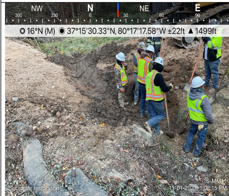
Photo Description: Survey team on-site assisting with restoration of pre-existing conditions.