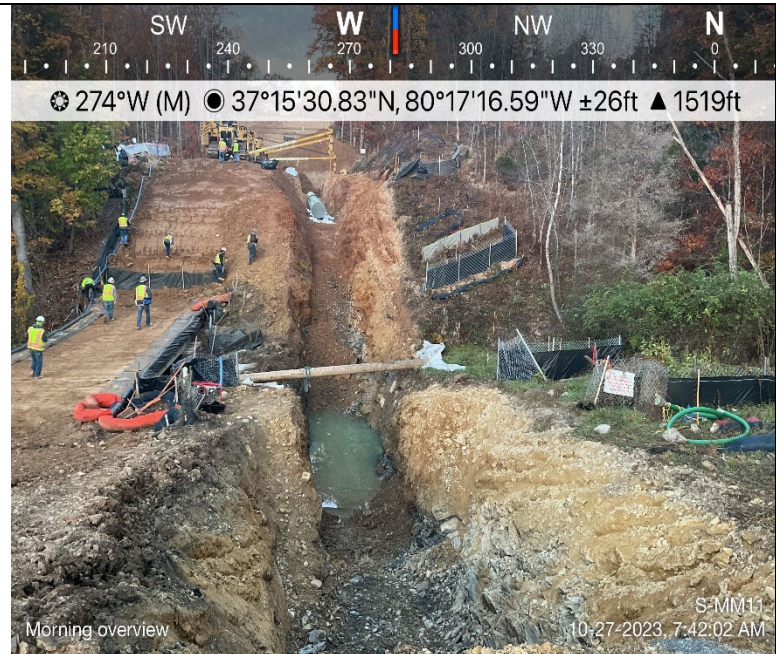
Photo Description: Overview of crossing area. Flume installed to convey any streamflow across the impact area throughout the crossing.