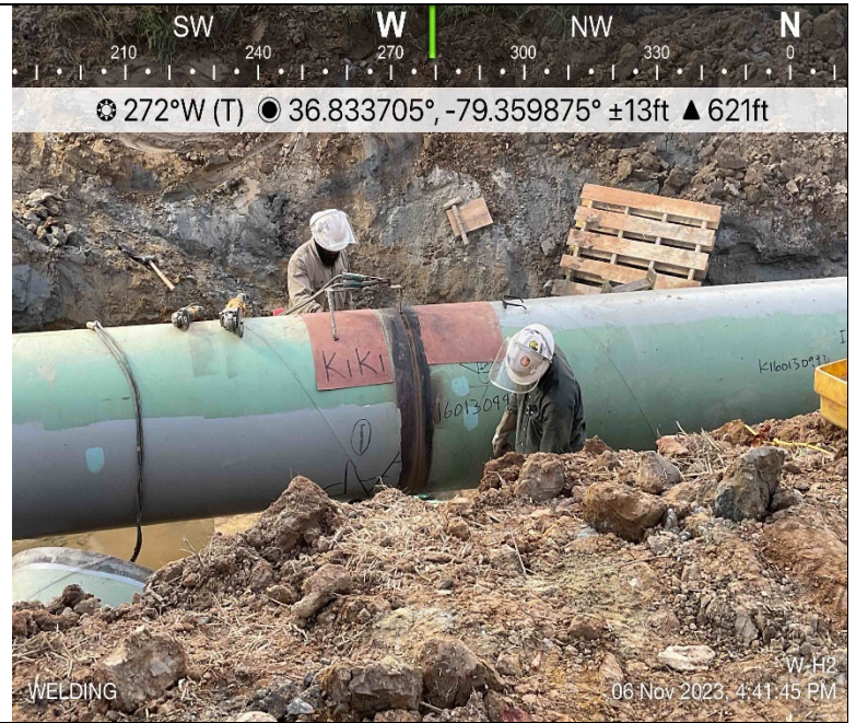
Photo Description: Welding activities within the wetland impact area.