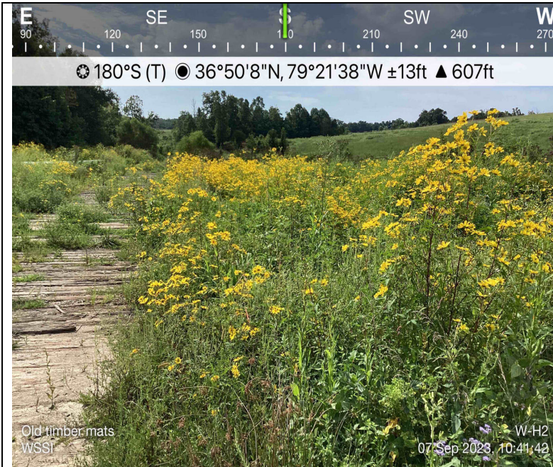
Photo Description: View of permitted resource impact area during pre-construction assessment.