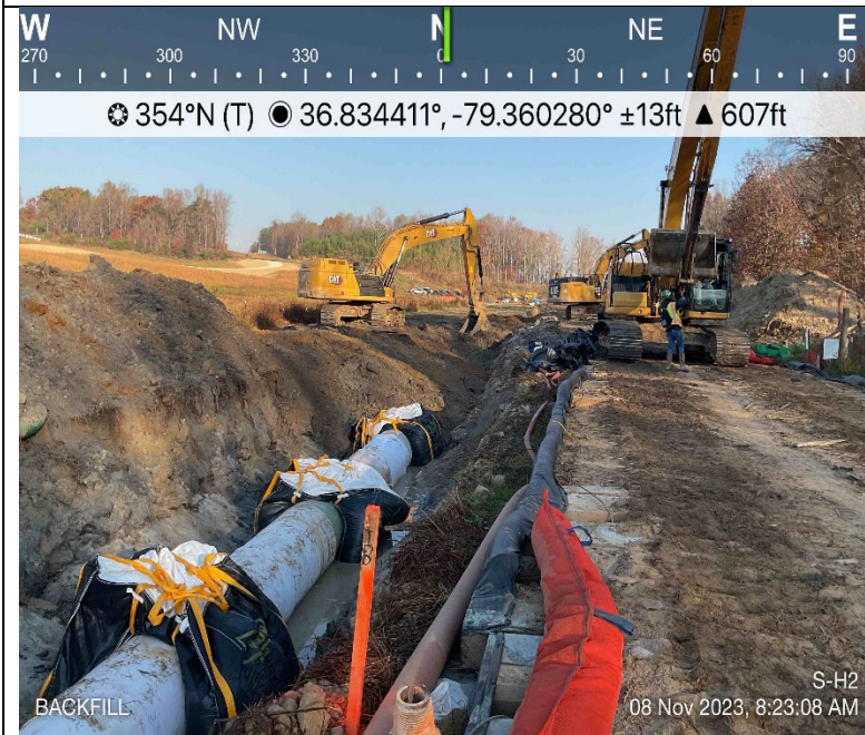
Photo Description: Backfill operations within resource crossing areas. Typo in photo watermark, "W-H2", not "S-H2"