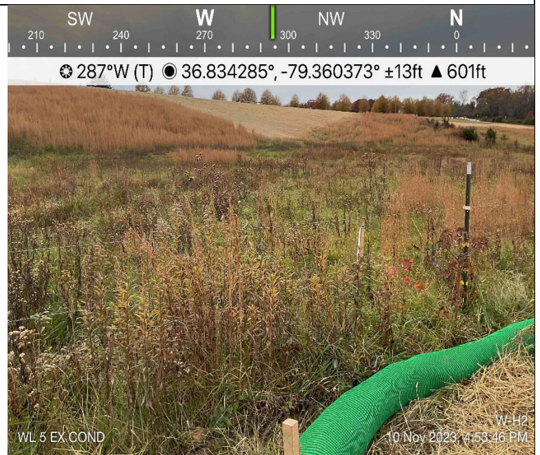
Photo Description: At edge of LOD, view of unpermitted resource area conditions during post-construction assessment.