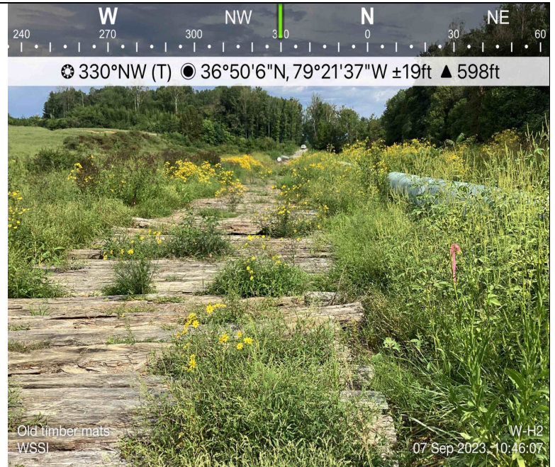
Photo Description: At edge of LOD, view of unpermitted resource area conditions during pre-construction assessment.