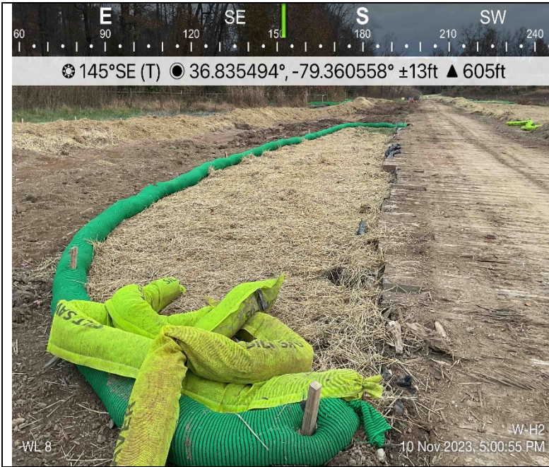
Photo Description: Wetland boundary maintained during restoration, but timber mats remain in place across wetland area to maintain access during completion of upland areas.