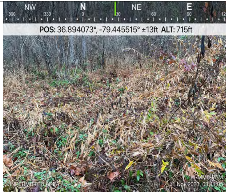
Photo Description: At edge of LOD, view of unpermitted resource area conditions during pre-construction assessment.