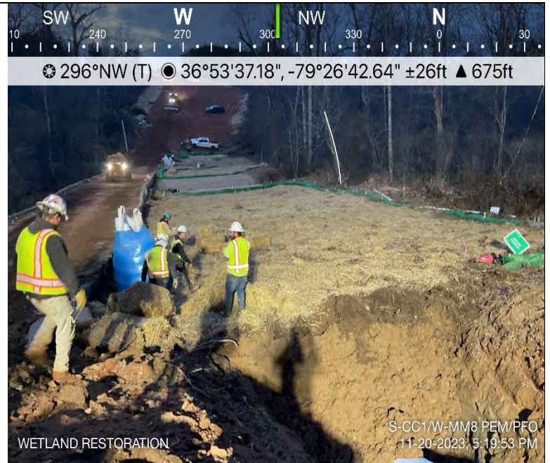
Photo Description: Restoration of seed and straw to the wetland impact area.