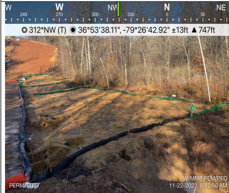
Photo Description: View of permitted resource impact area during post-construction assessment.