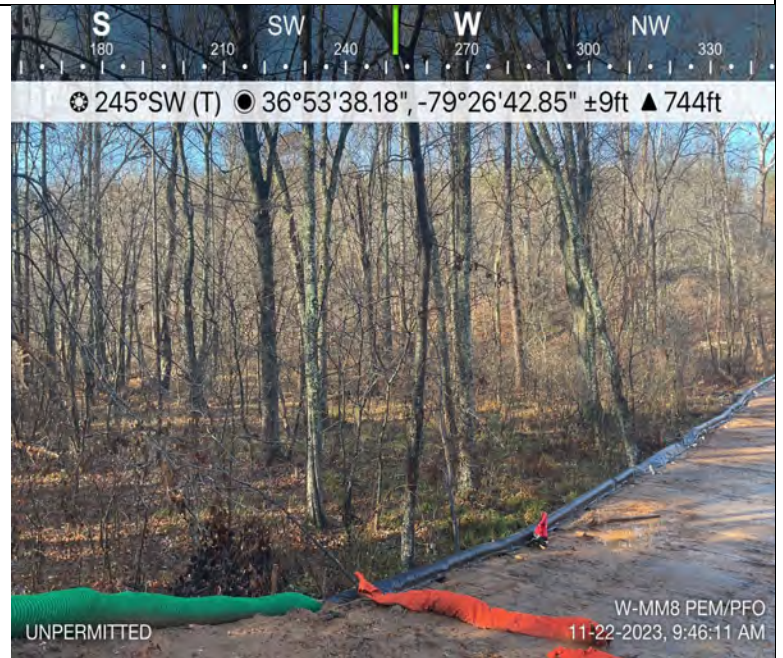
Photo Description: At edge of LOD, view of unpermitted resource area conditions during post-construction assessment.