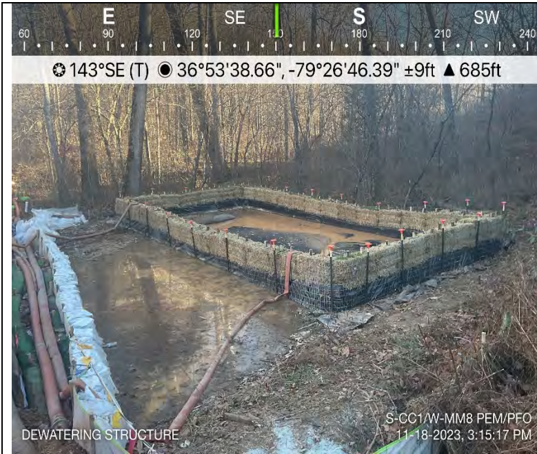
Photo Description: Dewatering structure installed and operational throughout crossing.