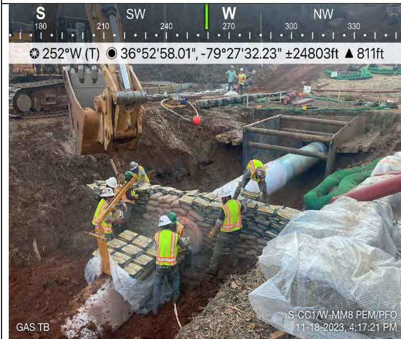
Photo Description: Trenchbreaker installation on the going away side of the resource.