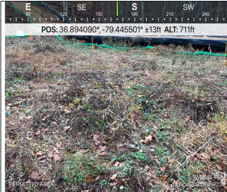
Photo Description: View of permitted resource impact area during pre-construction assessment.