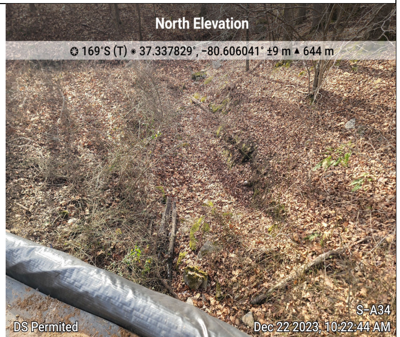
Photo Description: Conditions of the downstream area outside the ROW during post-construction assessment.