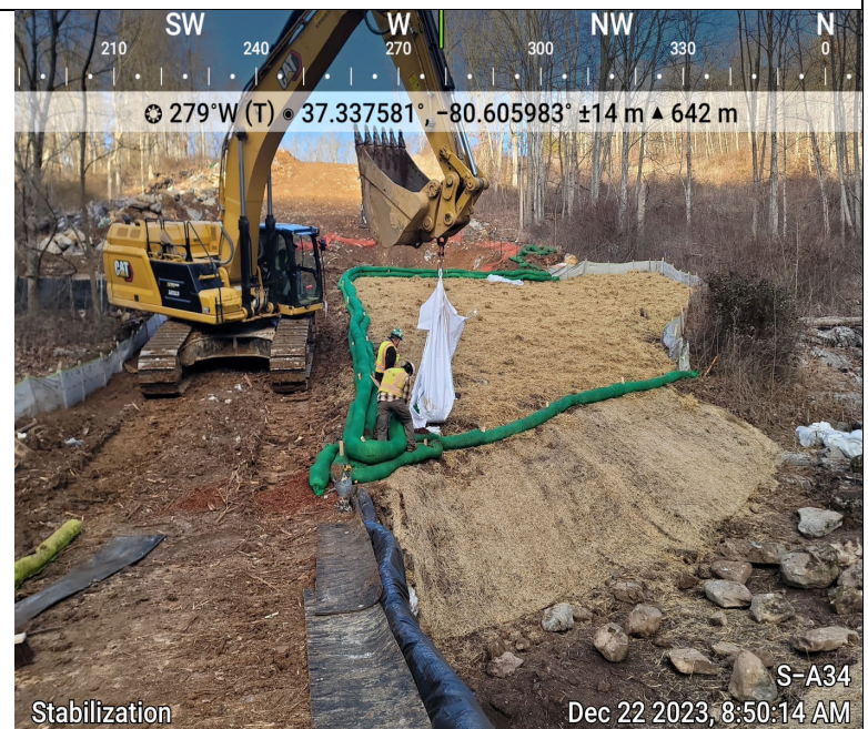
Photo Description: Stabilization being applied by environmental crews.

Photo Description: Dewatering structure installed and functional throughout crossing.