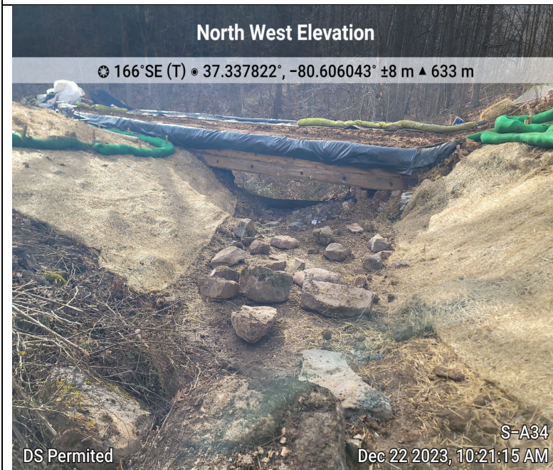
Photo Description: Downstream view of permitted impact area during post-construction assessment.