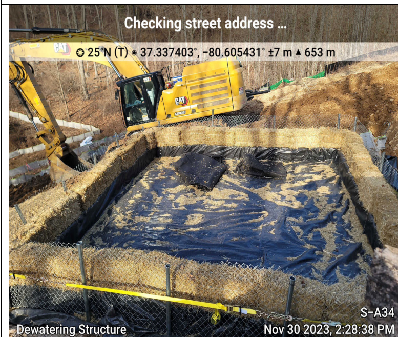
Photo Description: Dewatering structure installed and functional throughout crossing.

Photo Description: Downstream dam and energy dissipator.