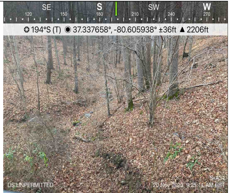
Photo Description: Conditions of the downstream area outside the ROW during pre-construction assessment.