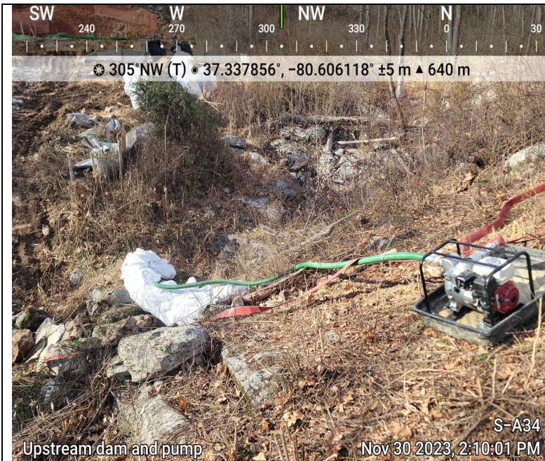
Photo Description: Dam and pump installed and functional throughout crossing.