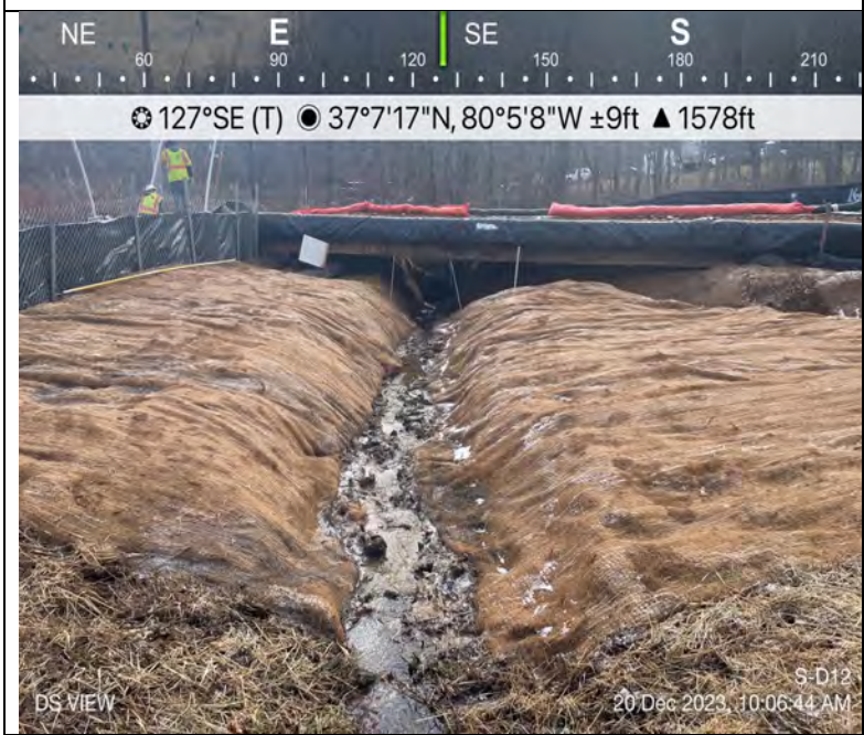
Photo Description: Downstream view of permitted impact area during post-construction assessment.