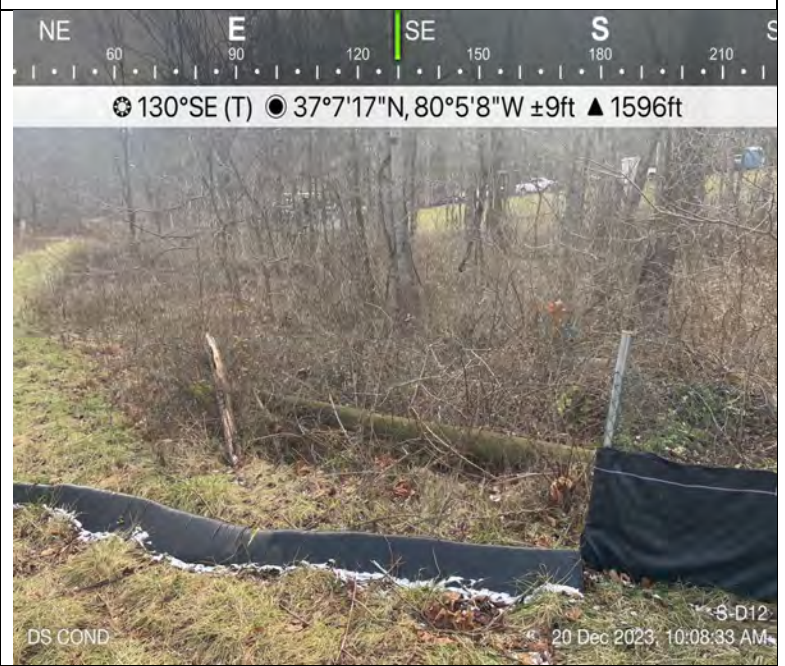
Photo Description: Conditions of the downstream area outside the ROW during post-construction assessment.