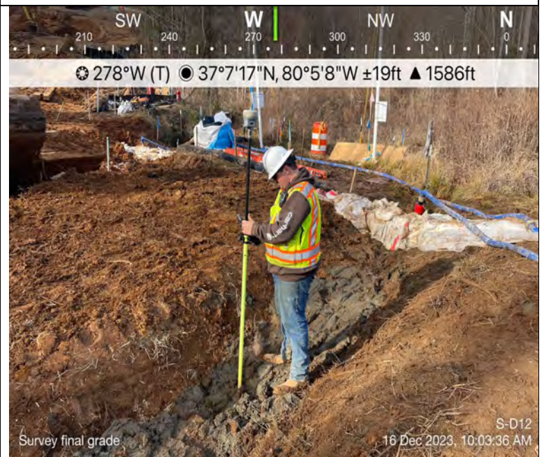
Photo Description: Survey shooting the final grade for the stream bed elevation.