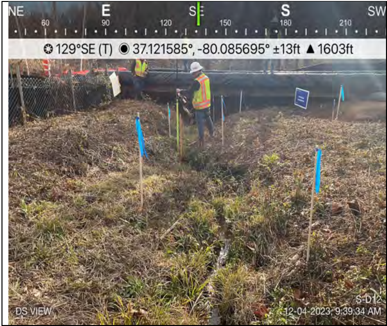
Photo Description: Downstream view of permitted impact area during pre-construction assessment.