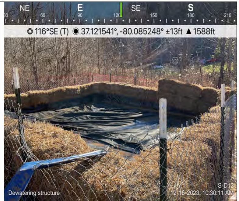
Photo Description: An overview of the dewatering structure functioning as designed.