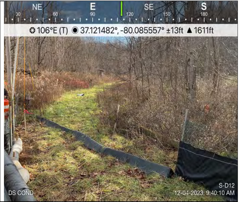
Photo Description: Conditions of the downstream area outside the ROW during pre-construction assessment.