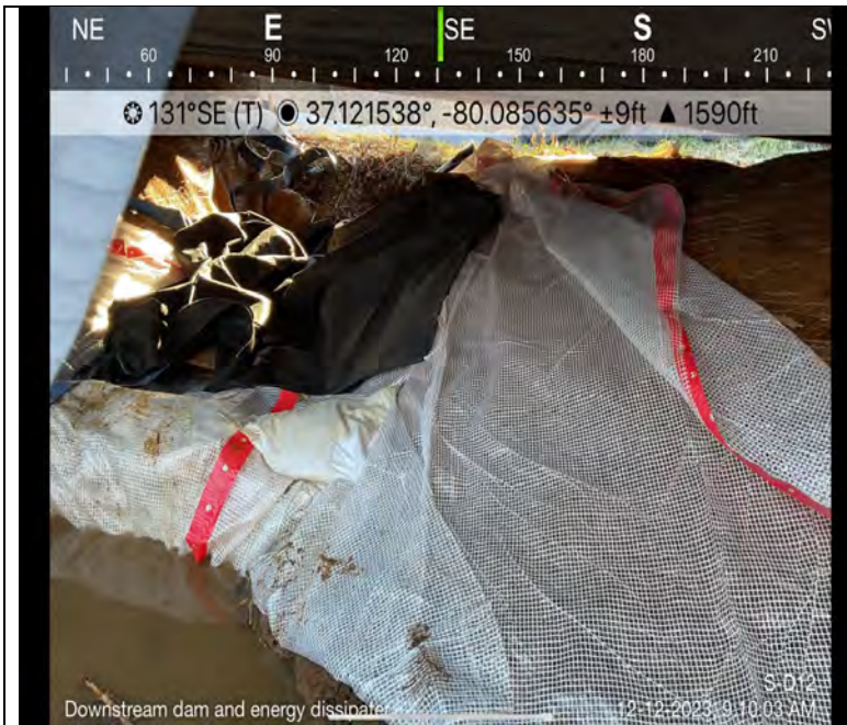
Photo Description: An overview of the downstream dam and energy dissipater.