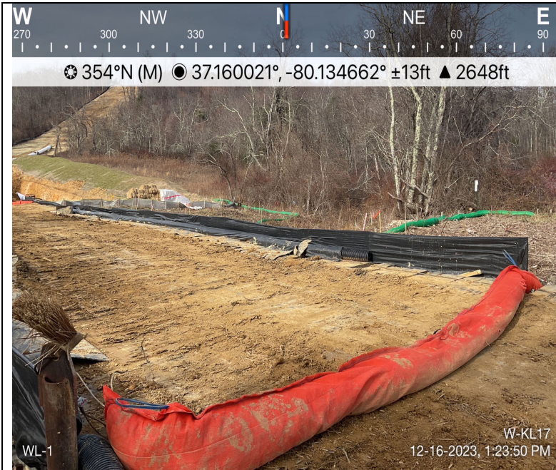
Photo Description: View of permitted resource impact area during pre-construction assessment.