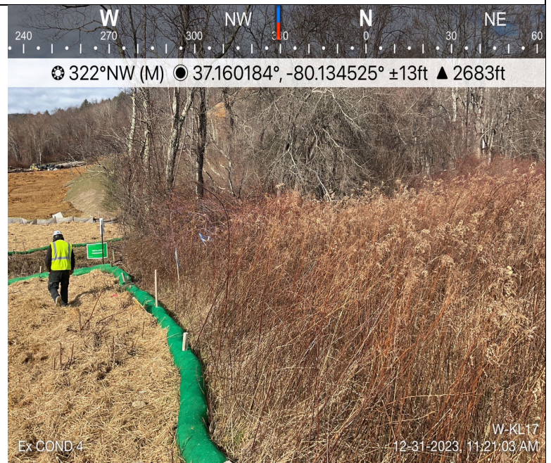
Photo Description: At edge of LOD, view of unpermitted resource area conditions during post-construction assessment.