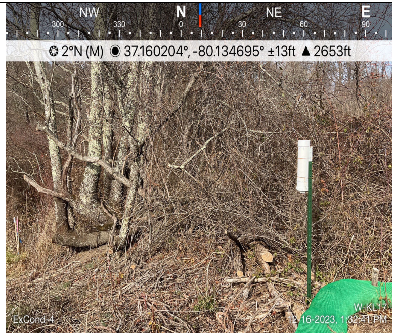
Photo Description: At edge of LOD, view of unpermitted resource area conditions during pre-construction assessment.