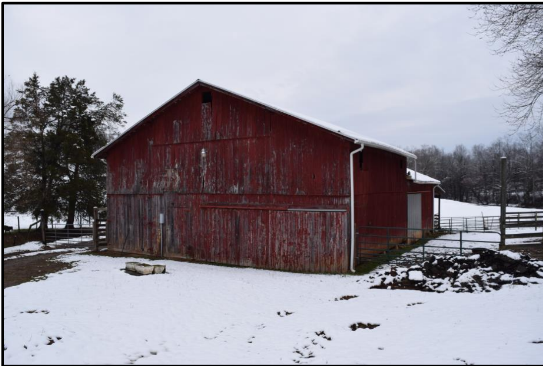
Figure 3: Barn at 3157 Booker T. Washington Highway (Route 122) Rocky Mount, Franklin County, View Northeast