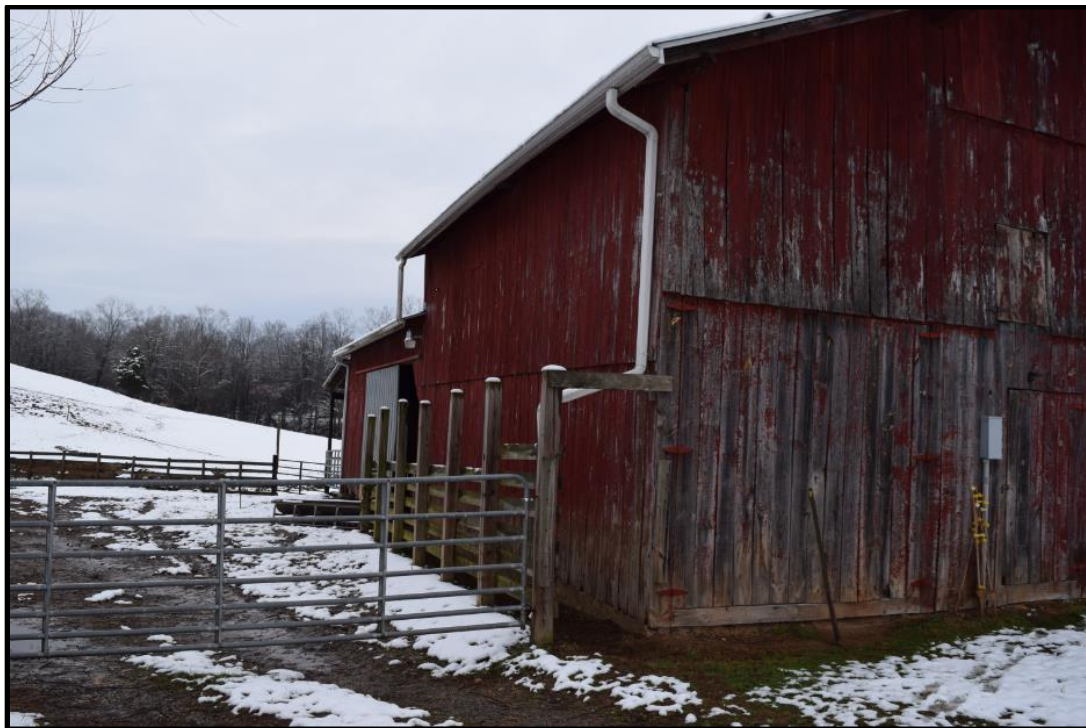
Figure 5: Barn at 3157 Booker T. Washington Highway (Route 122) Rocky Mount, Franklin County, View East