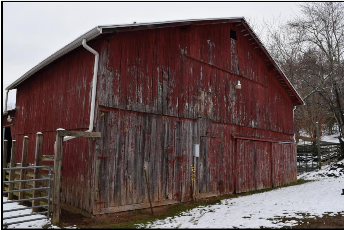
Figure 4: Barn at 3157 Booker T. Washington Highway (Route 122) Rocky Mount, Franklin County, View Southeast