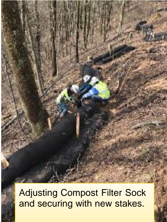
Adjusting Compost Filter Sock and securing with new stakes.