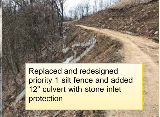
Replaced and redesigned priority 1 silt fence and added 12" culvert with stone inlet protection