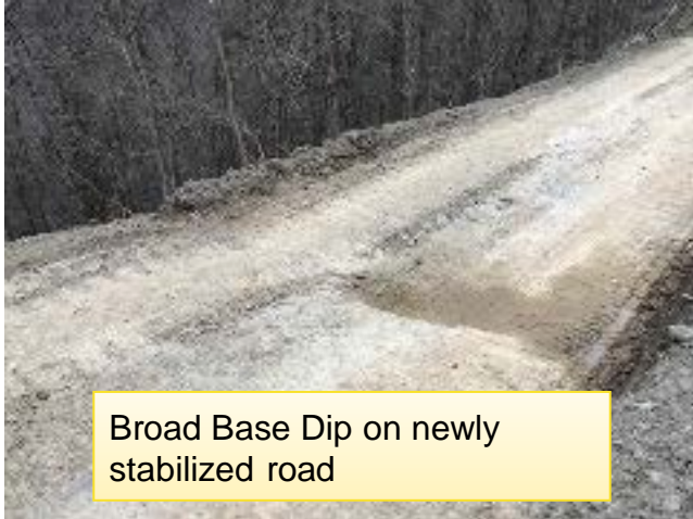
Broad Base Dip on newly stabilized road