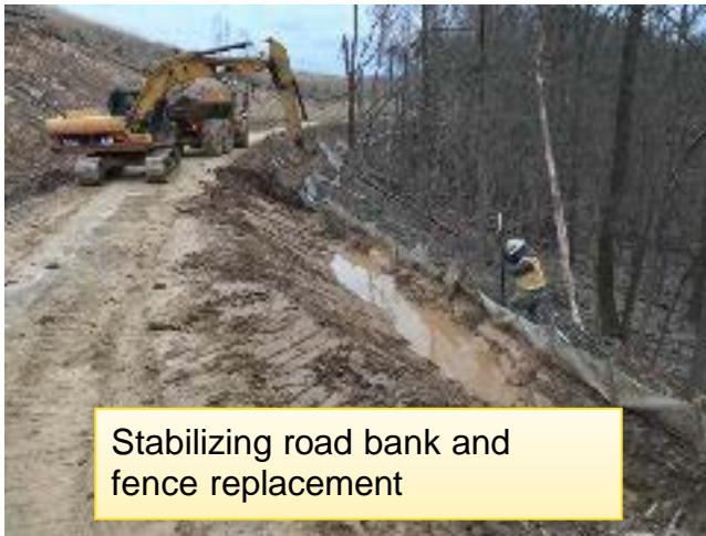
Stabilizing road bank and fence replacement