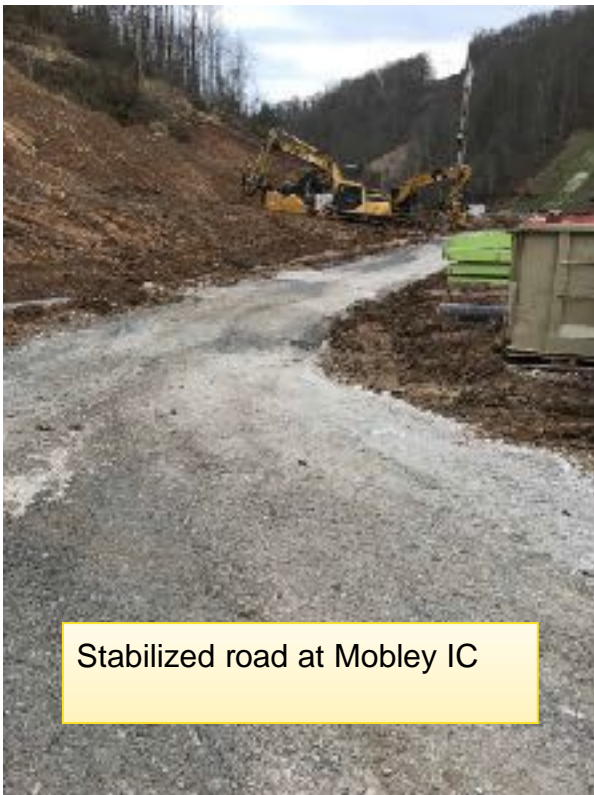
Stabilized road at Mobley IC