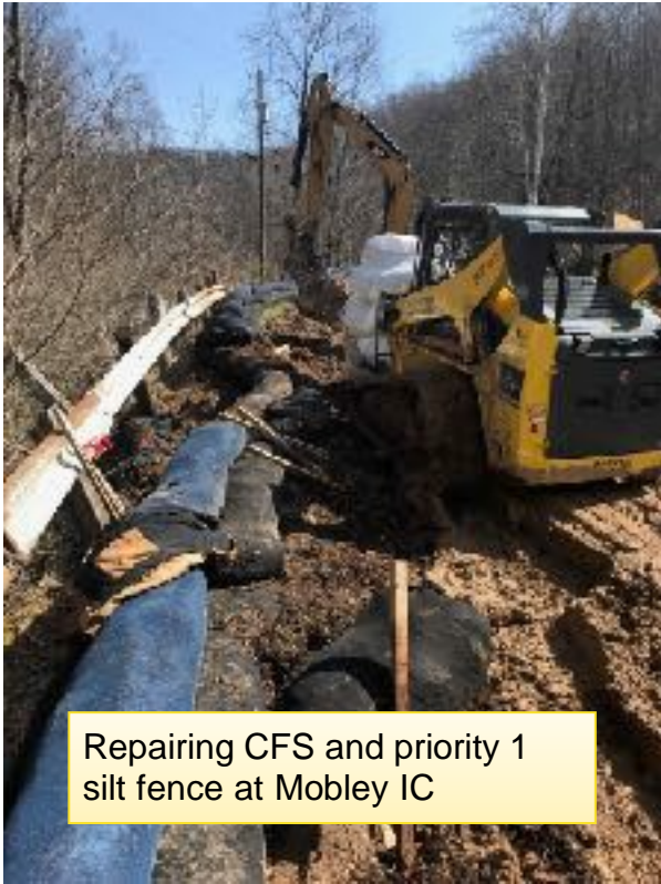
Repairing CFS and priority 1 silt fence at Mobley IC