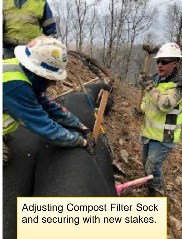
Adjusting Compost Filter Sock and securing with new stakes.