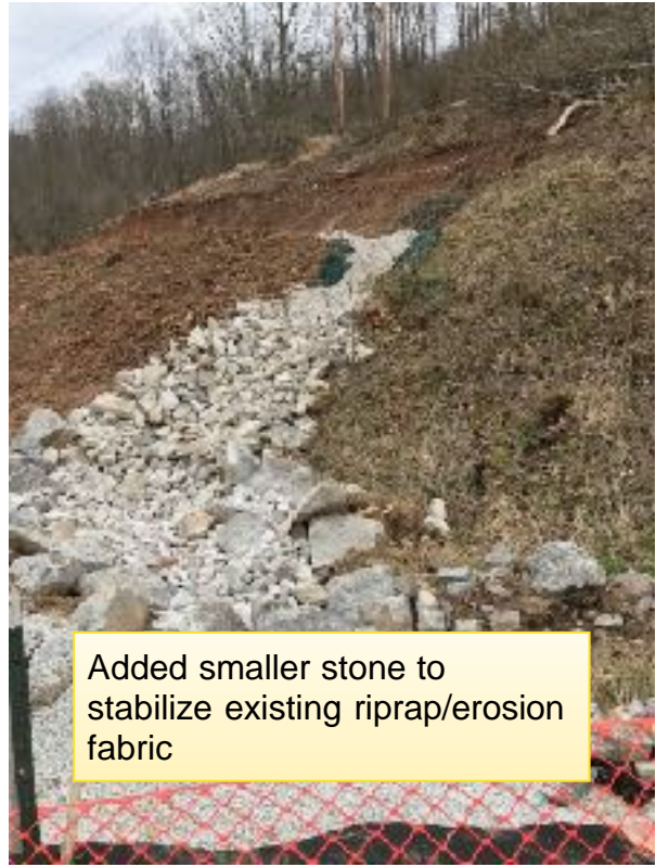
Added smaller stone to stabilize existing riprap/erosion fabric