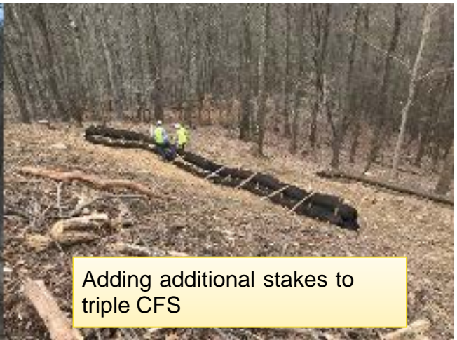
Adding additional stakes to triple CFS