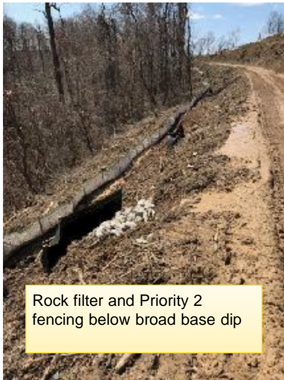
Rock filter and Priority 2 fencing below broad base dip