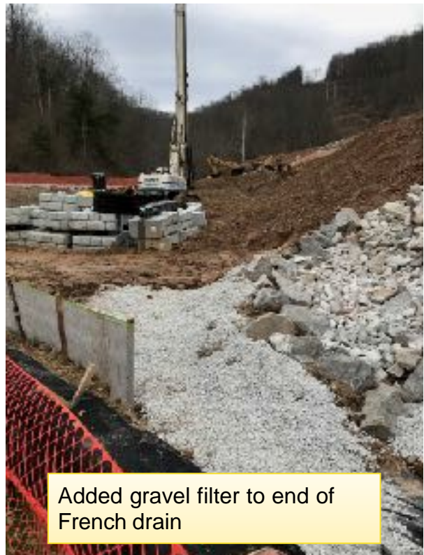
Added gravel filter to end of French drain