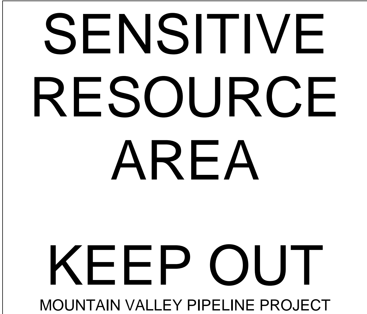
Figure 3-2. Typical Sign – SENSITIVE RESOURCE AREA KEEP OUT