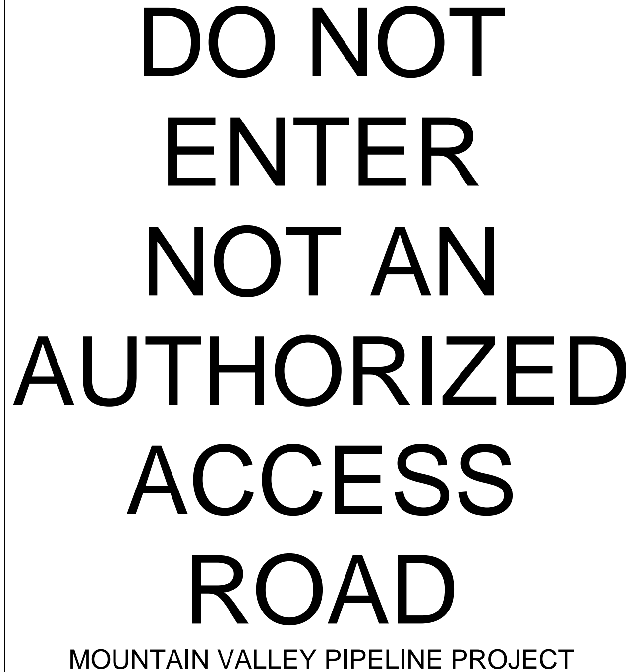
Figure 3-5. Typical Sign – DO NOT ENTER