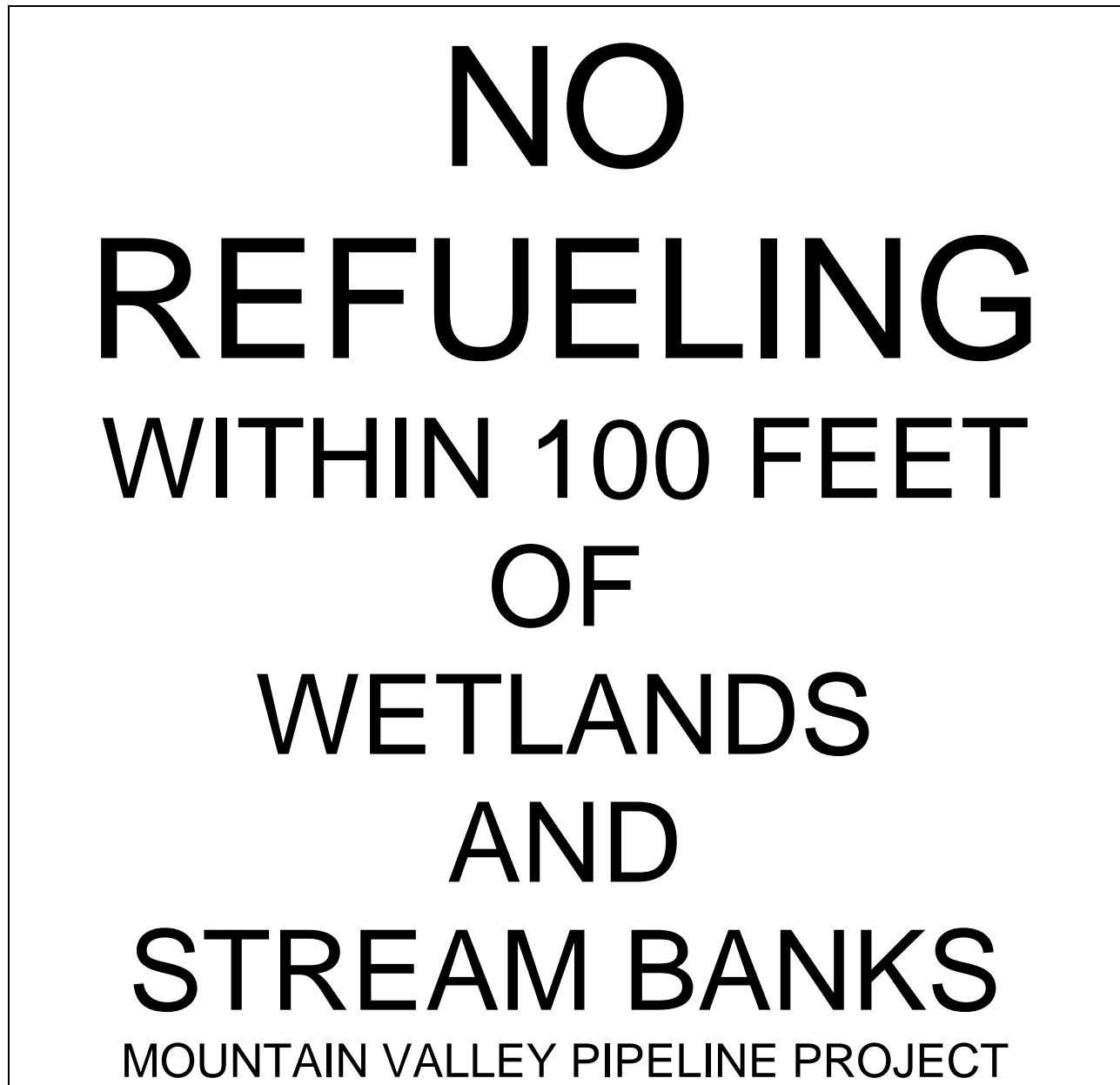
Figure 3-4. Typical Sign – NO REFUELING