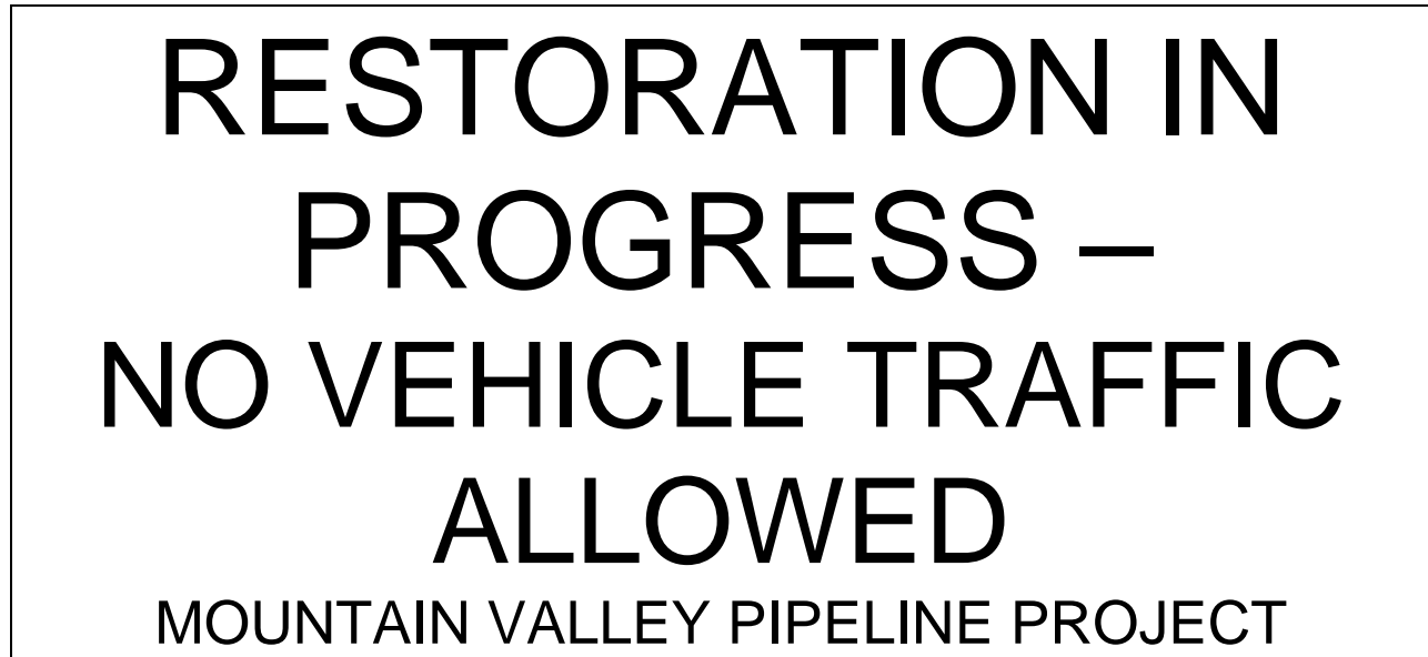
Figure 3-3. Typical Sign – RESTORATION IN PROGRESS – NO VEHICLE TRAFFIC ALLOWED